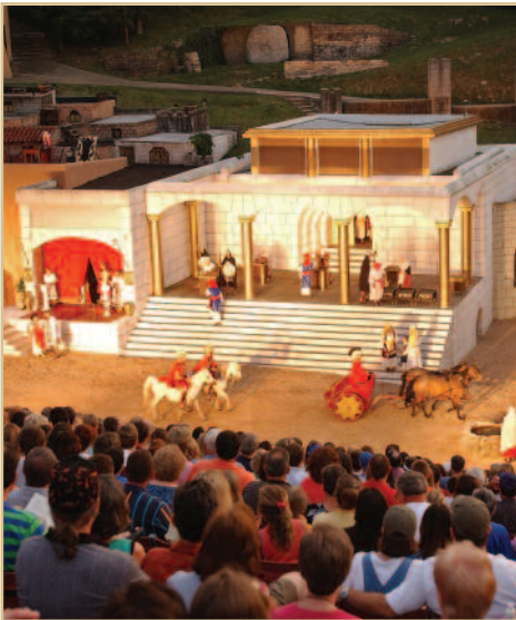
The Great Passion Play, Eureka Springs