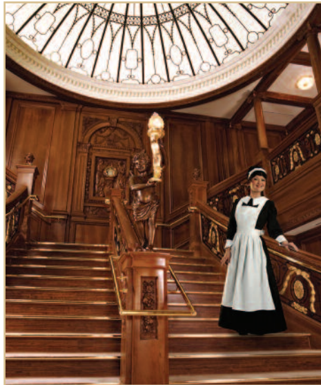
Titanic Museum, Branson

documents and video and enjoy a special lunch featuring the Clinton's favorite foods. There will even be time for photos with the "Clintons" before continuing on to Bentonville. Here, we visit the newly opened Crystal Bridges Museum of American Art. Built to house the permanent collection of private collectors such as Alice Walton, Crystal Bridges' collection features American masterworks dating from the Colonial era to contemporary times. Tonight, we attend a performance of The Great Passion Play performed in a panoramic outdoor amphitheater.