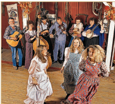
Ozark Folk Center

A visit to the Pea Ridge National Military Park shows us the site of the most pivotal Civil War battle, as well as the most intact Civil War battlefield in the United States. We make our way south in Arkansas to the town of Fayetteville where we join "Bill and Hillary" Clinton in their marital home. See the living room where they were married, relive their life through photographs,