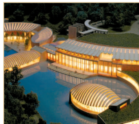
Crystal Bridges Museum of American Art