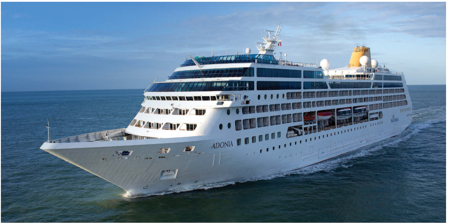
Enjoy a 7 night cruise from Miami circumnavigating Cuba aboard the Adonia