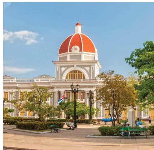
Charm abounds in Cienfuegos