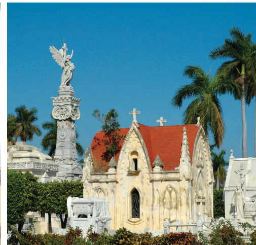
See the magnificently sculpted tombstones of Colón Cemetery