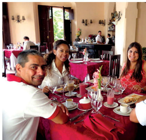
Enjoy an authentic Cuban lunch at a Paladar

Following breakfast, we disembark at the Port of Miami with wonderful memories of Cuba and its people as we continue on our journey home. Flight should depart Miami after 1:00p.m. (All meals included)