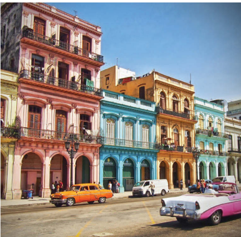
Architecture of Havana

This morning, we dock in Havana. After breakfast, disembark the ship and begin the cultural exploration of this beautiful city. During the guided walking tour, pass through the four main squares of 'Havana Viejo' (Old Havana): Plaza Vieja, San Francisco de Assisi, Plaza de Armas and Cathedral Square. Meet business owners and workers and see firsthand why current