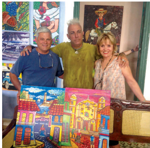
Meet local artisans at the San José Artisans' Market