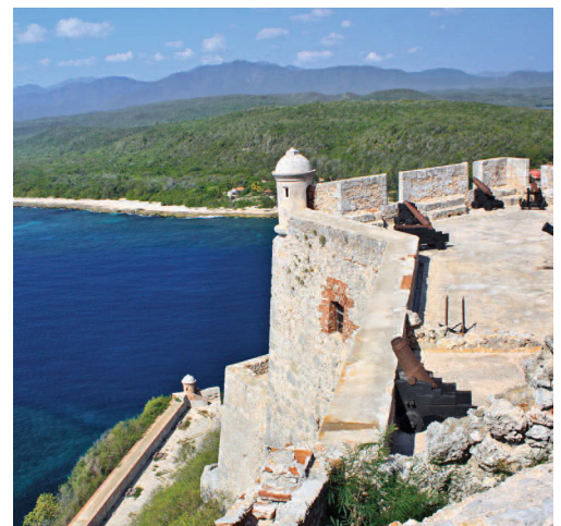
Visit the local citadel of San Pedro de la Roca