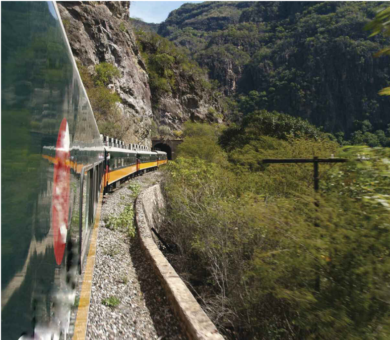
All aboard as we take to the rails through Mexico's Copper Canyon