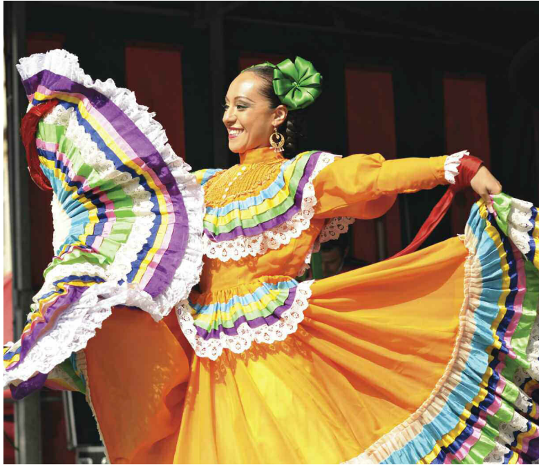
Watch the fabulous Mexican ballet Folklorico