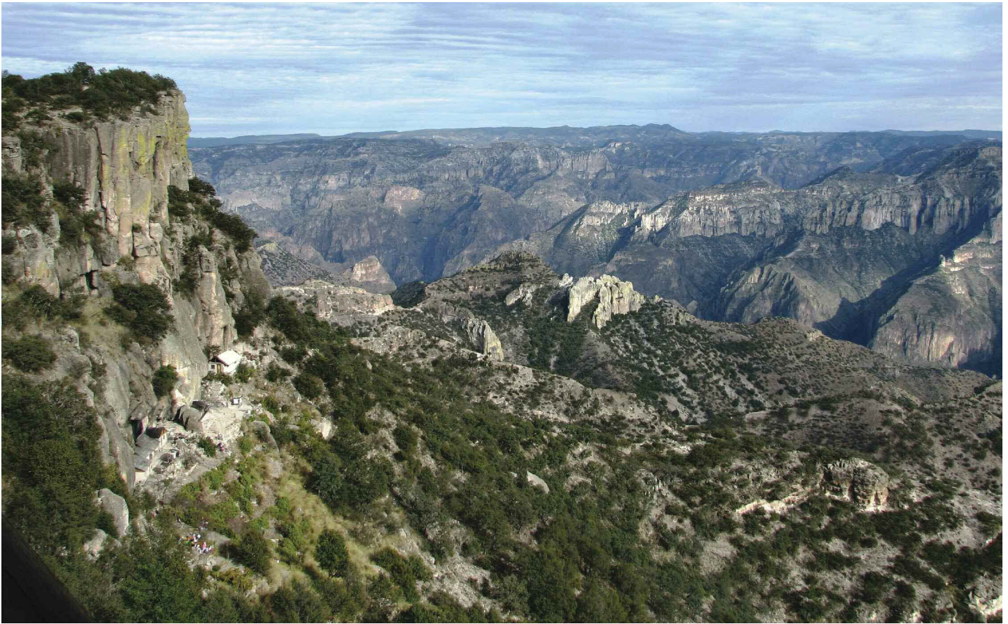
Mexico's Copper Canyon