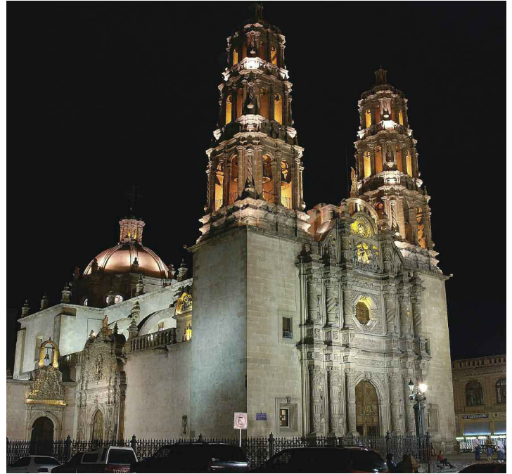
Cathedral of Chihuahua

group has performed throughout the world and will introduce us to the traditional regional dances of Mexico.