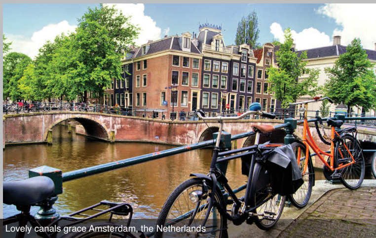
Lovely canals grace Amsterdam, the Netherlands