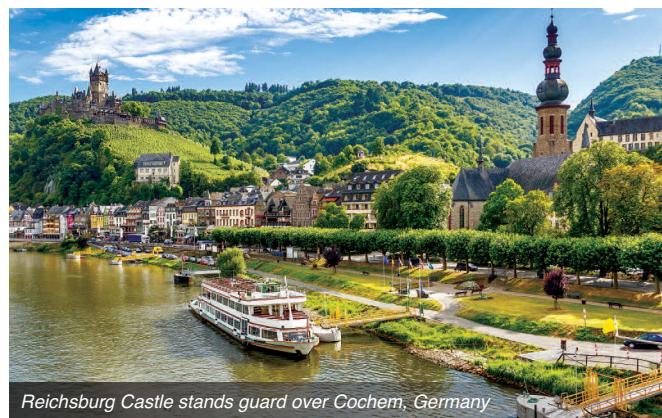
Reichsburg Castle stands guard over Cochem, Germany

This morning after breakfast you arrive in Cochem where along the beautiful Mosel River, countless vineyards with varying shades of green and squares of grapevines unfold before your eyes. Cochem, rated one of the prettiest villages along the Mosel, is best known for its fortified gates, pastel-colored or half-timbered buildings, Baroque towers and vintages of Mosel Riesling wine. Enjoy an included guided tour of the 19th-century Reichsburg Castle with its many spires and mighty brick walls that provide contrast to the surrounding lush vegetation.