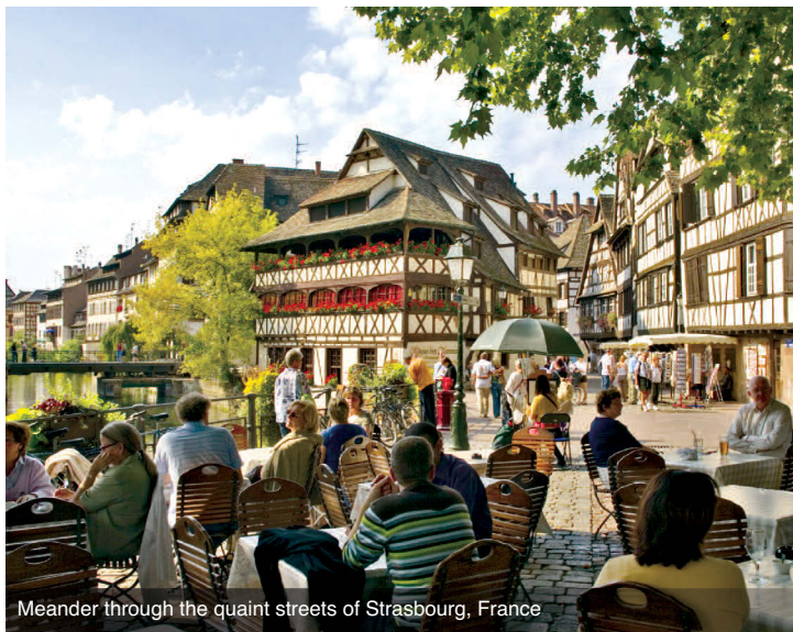
Meander through the quaint streets of Strasbourg, France