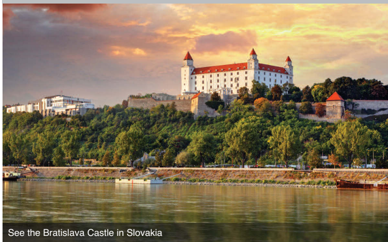
See the Bratislava Castle in Slovakia