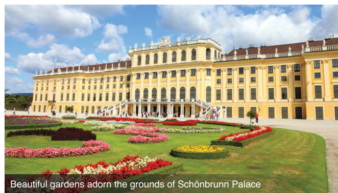
Beautiful gardens adorn the grounds of Schönbrunn Palace

Discover all Vienna has to offer with an included orientation tour. For over 600 years, the magnificent baroque capital city of Vienna was the seat of the mighty Hapsburg Emperors, a her-