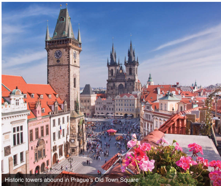
Historic towers abound in Prague's Old Town Square

itage that has bestowed it with many dazzling palaces and monuments: the lavish Hofburg Palace, the impressive Vienna Opera House and the majestic Ringstrasse. The capital is also known as the “City of Music” for having once been the home of composers such as Beethoven, Schubert, Mozart and Johann Strauss. On your included excursion, see some of the famous sights of this impressive city and visit Schönbrunn Palace, with its magnificent interiors and landscape gardens. Enjoy leisure time in the city center in the afternoon. This evening, join an optional excursion for a musical concert in one of the famous music venues of the city. (Breakfast, lunch, dinner and evening snack onboard)