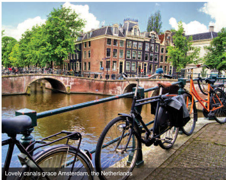
Lovely canals grace Amsterdam, the Netherlands