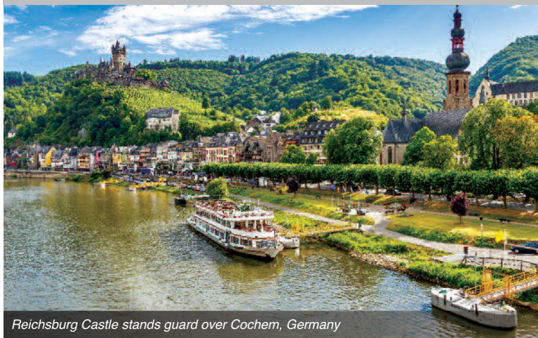
Reichsburg Castle stands guard over Cochem, Germany