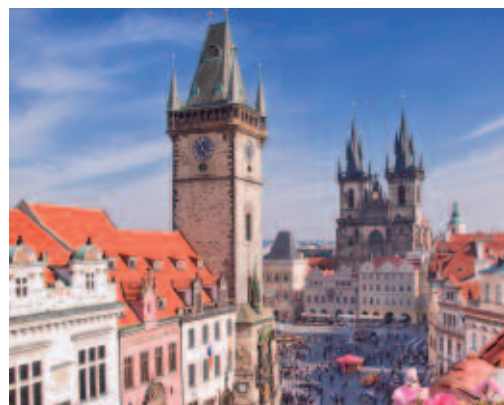
The orange-tile roofs of Prague, Czech Republic