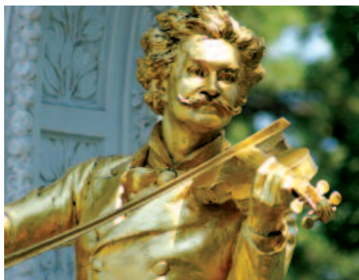
Vienna - for music lovers and lovers of life

Enjoy the views as your river ship sails to Bratislava, Slovakia's capital (formerly known as Pressburg and for more than three centuries during the Middle Ages, capital of Hungary). On an included panoramic tour of the city see the imposing Bratislava Castle built more than 1,000