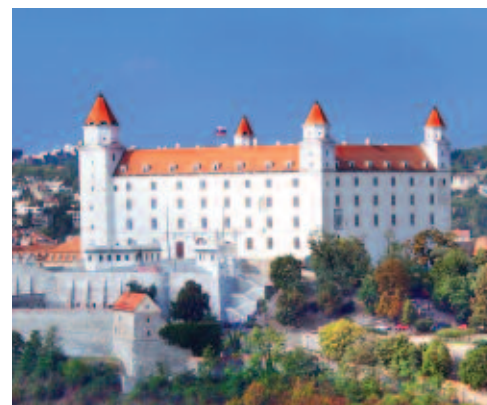
See the Bratislava Castle in Slovakia

In the 2nd century, Roman soldiers built a forti-