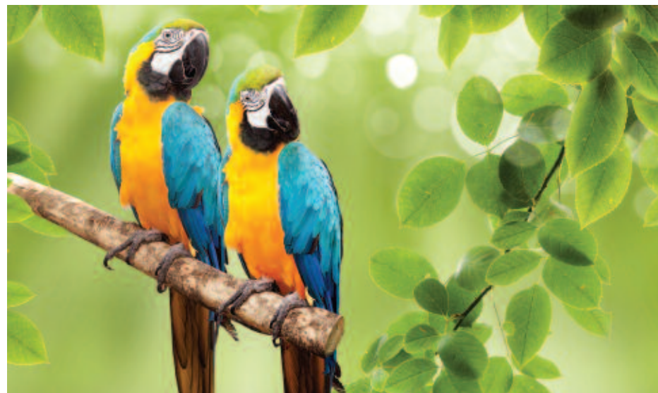
Colorful macaws along the Yarapa River

Plan and benefits offered and administered by Trip Mate, Inc.