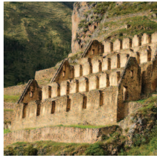
Inca Ruins at Ollantaytambo