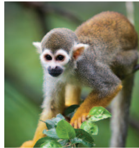
Squirrel Monkey, Amazon Natural Park and Reserve