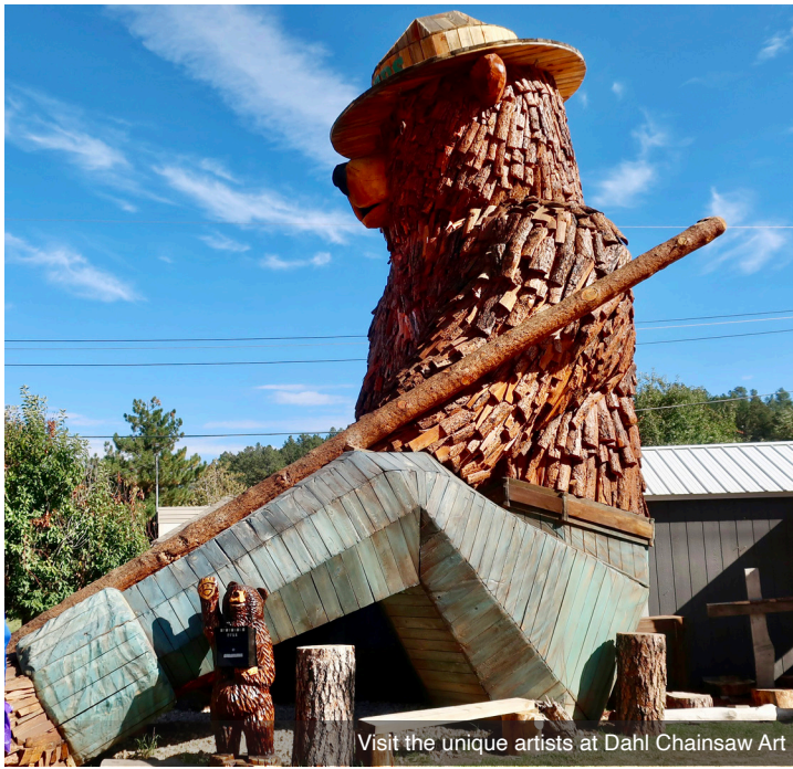
Visit the unique artists at Dahl Chainsaw Art

an on own lunch. Then, a local guide takes you through Badlands National Park, a uniquely beautiful geologic area formed over millions of years by wind, rain and erosion. Return to Rapid City for a farewell dinner featuring the entertainment of an Indian dancer, storyteller and flute player. Meals: B, D