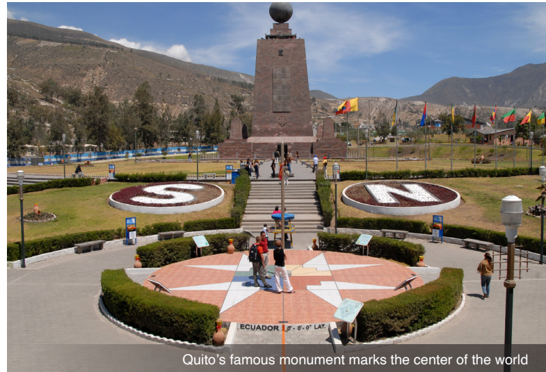
Quito's famous monument marks the center of the world

DAY 1 Depart the USA: Depart the USA on a flight to Quito, Ecuador. Upon arrival, you'll be met by a representative of Mayflower Cruises and Tours and assisted with the transfer to the hotel. Enjoy the remainder of the evening to experience this amazing city on your own.