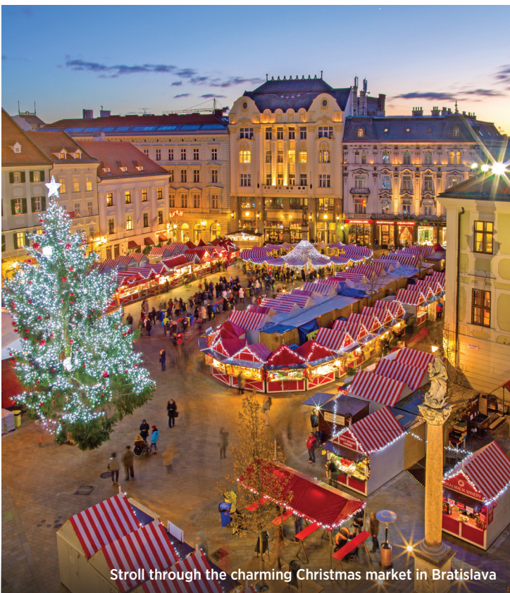
Stroll through the charming Christmas market in Bratislava

Today, enjoy a morning sailing on your Star-Ship as it sails through the fascinating Wachau Valley, part of the UNESCO World Heritage-listed Wachau Cultural Landscape. This afternoon, embark on a guided tour of Göttweig Abbey, a true treasure overlooking the valley from a hill covered by vineyards and forests. Built in 1083, it's one of Austria's most important Benedictine abbeys, attracting visitors from around the globe. Run by a community of about 45 monks, it's visible from a great distance and provides epic panoramas from the grounds. As part of the tour you get to taste the delightful Göttweig wine, which is a tradition well kept by the monks throughout centuries. Meals: B, L, D