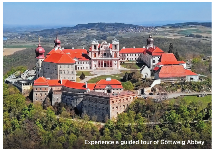
Experience a guided tour of Götweig Abbey