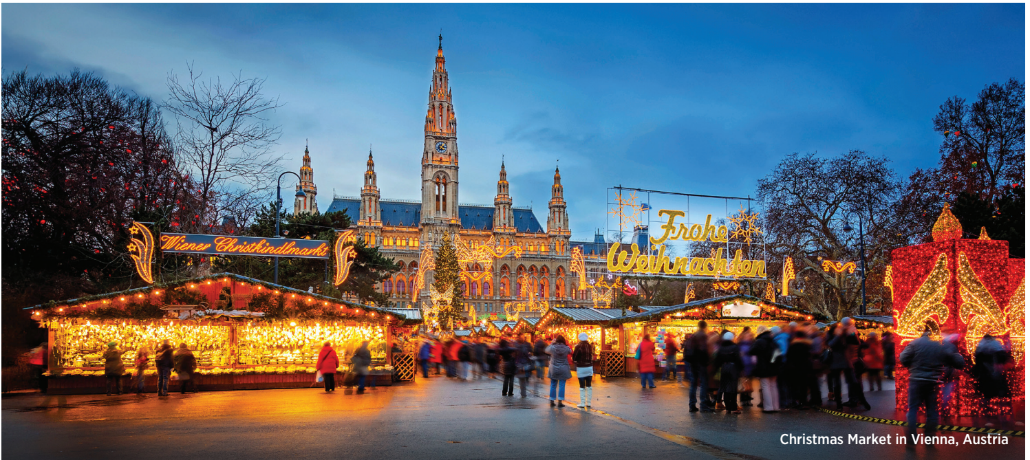
Christmas Market in Vienna, Austria