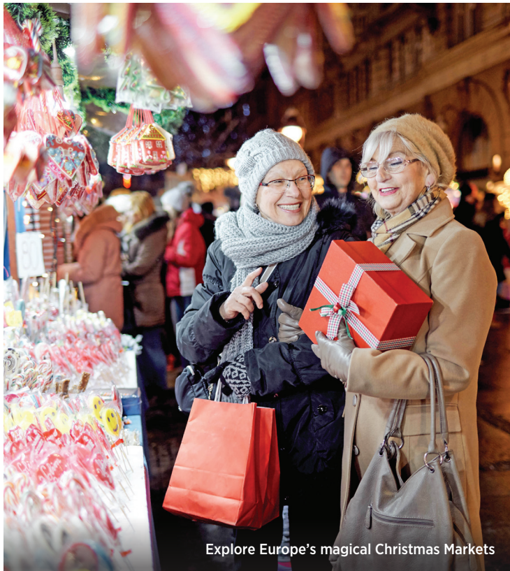
Explore Europe's magical Christmas Markets