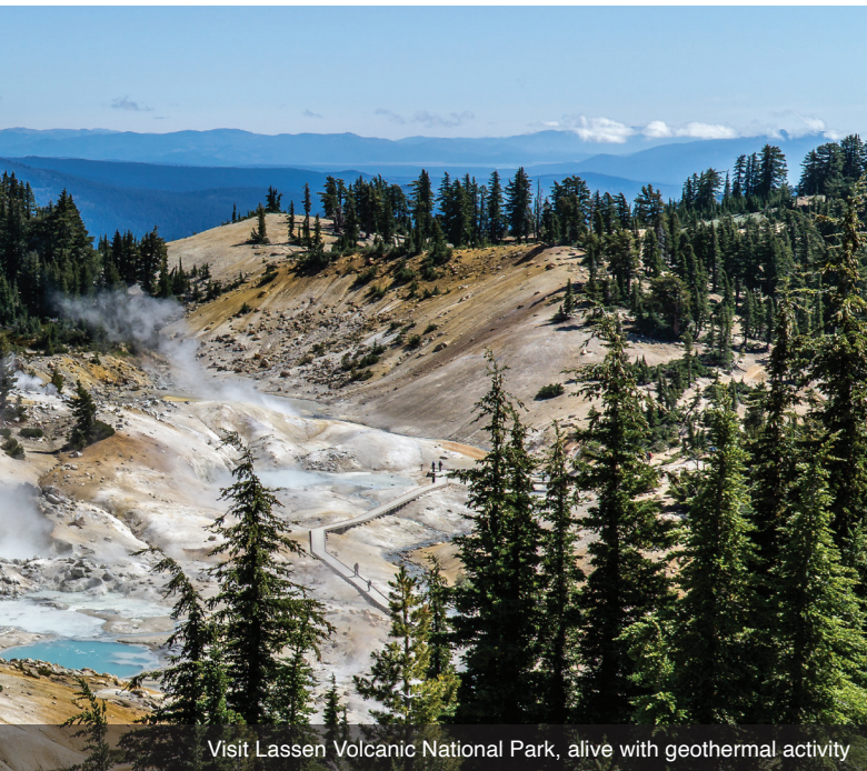
Visit Lassen Volcanic National Park, alive with geothermal activity

Then, make a stop at the unique North American Bigfoot Center featuring a wide array of bigfoot evidence and historical artifacts.