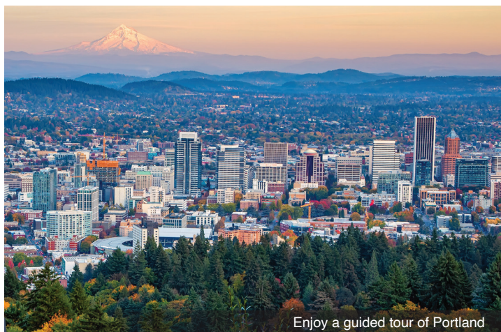
Enjoy a guided tour of Portland

DAY 10 Travel Home: Depart for home from this memorable vacation with a group transfer to Portland's International Airport for flights out after 12:00 p.m. Meal: B