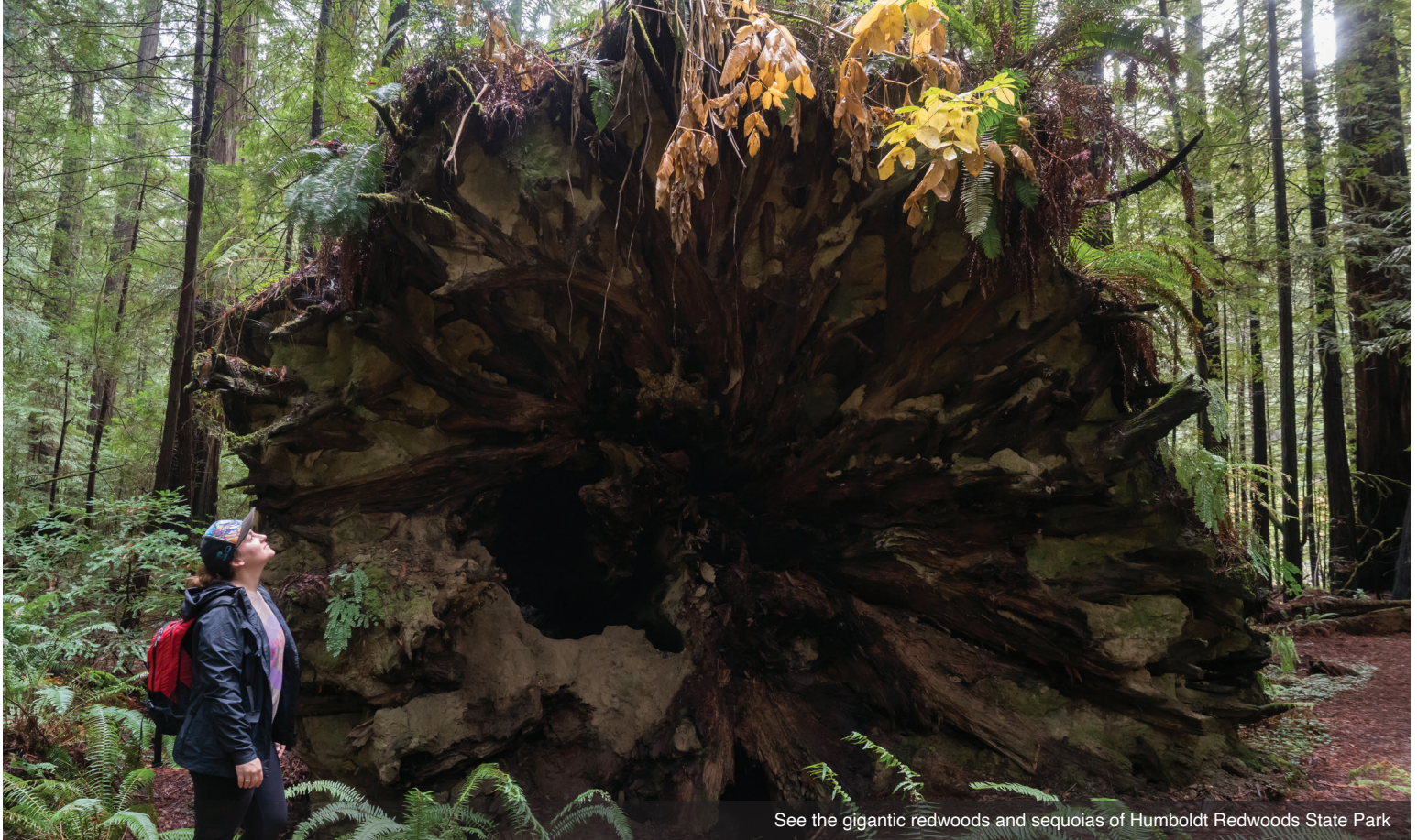
See the gigantic redwoods and sequoias of Humboldt Redwoods State Park