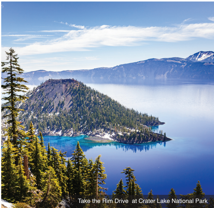
Take the Rim Drive at Crater Lake National Park