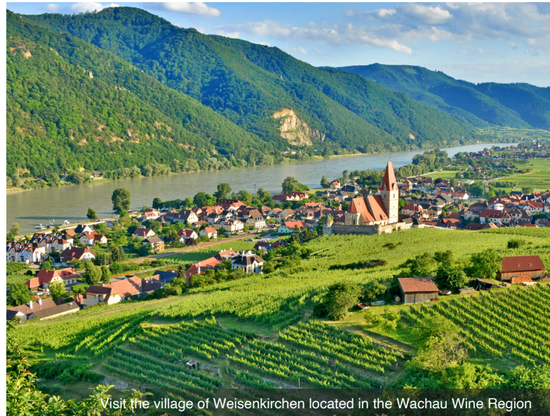
Visit the village of Weisenkirchen located in the Wachau Wine Region

DAY 1 Depart the USA: Depart the USA on your overnight flight to Budapest, Hungary.