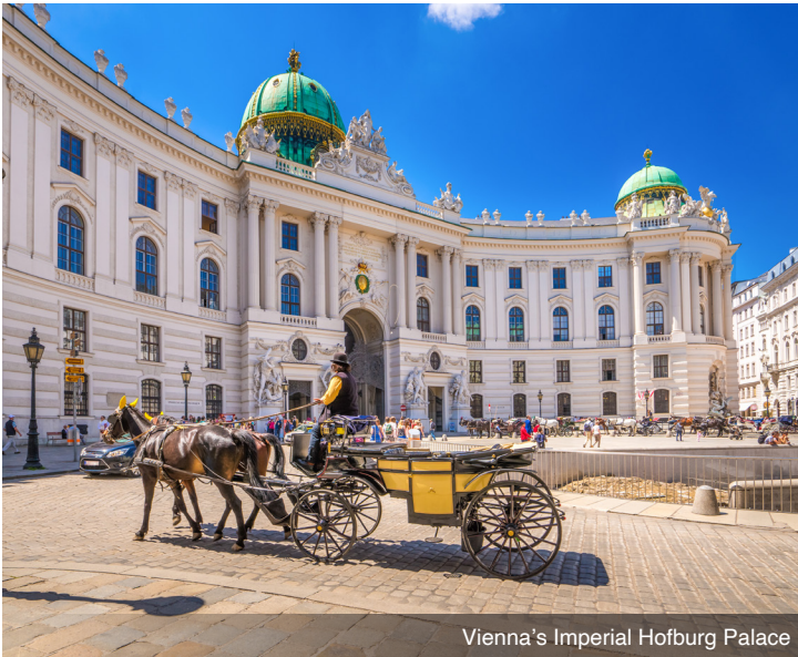
Vienna's Imperial Hofburg Palace