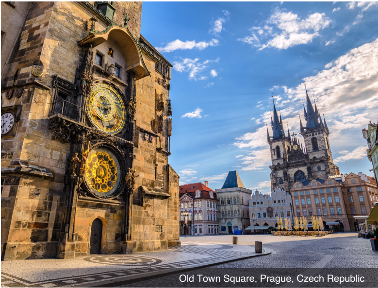
Old Town Square, Prague, Czech Republic

atmosphere of Český Krumlov's medieval buildings, the iconic castle complex and the 15th-century St. Vitus' Church, a highlight of the town. Alternatively, choose the DiscoverMORE option to visit Salzburg, Austria. Meals: B, D