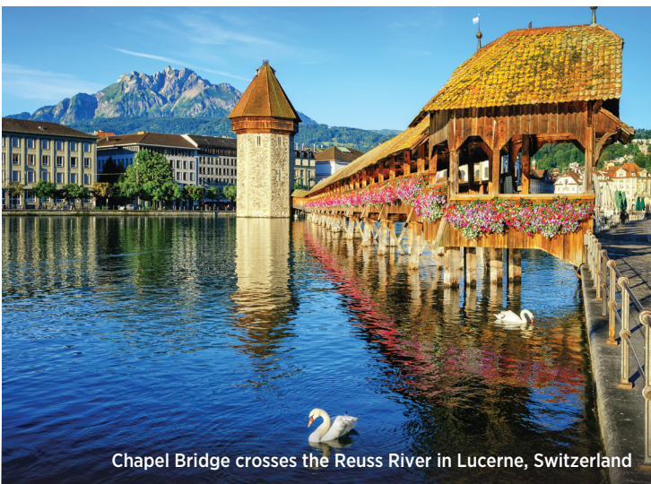
Chapel Bridge crosses the Reuss River in Lucerne, Switzerland

After breakfast, an included walking tour highlights the city's landmark, the famous 14th-century Chapel Bridge with its paintings of heroic town events, that crosses the Reuss River. See the 17th-century Renaissance Town Hall and town squares, all set amongst the beautiful backdrop of the Swiss Alps. The remainder of the day is at leisure. Meal: B