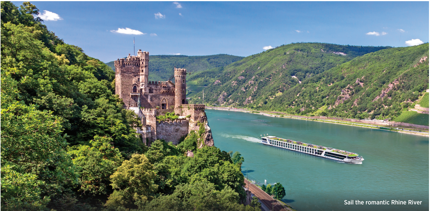
Sail the romantic Rhine River