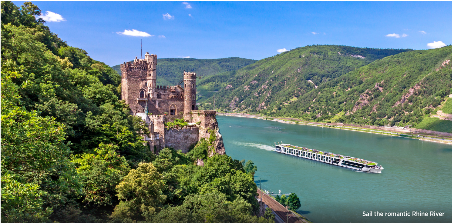
Sail the romantic Rhine River