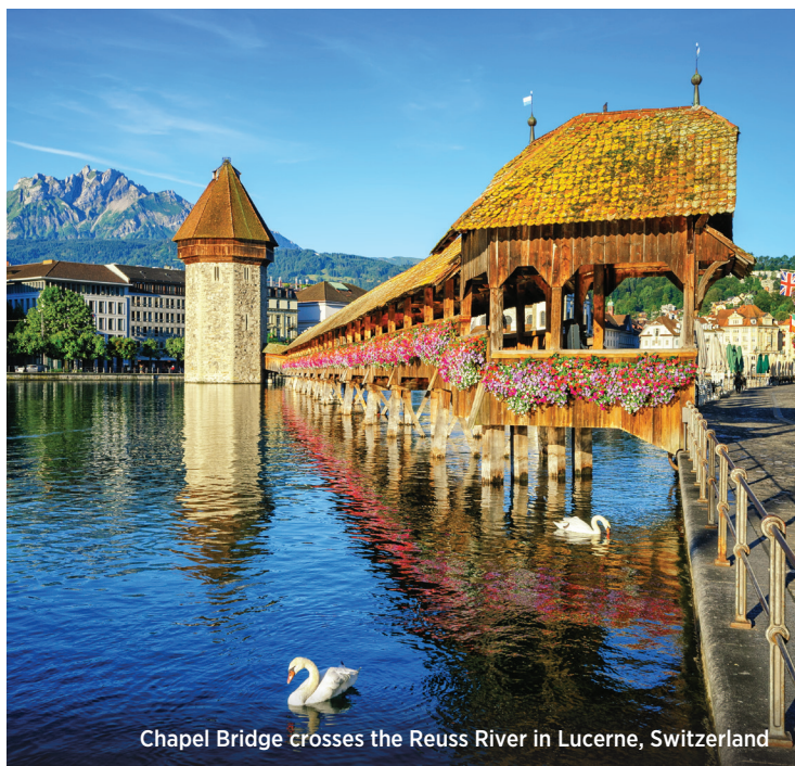
Chapel Bridge crosses the Reuss River in Lucerne, Switzerland