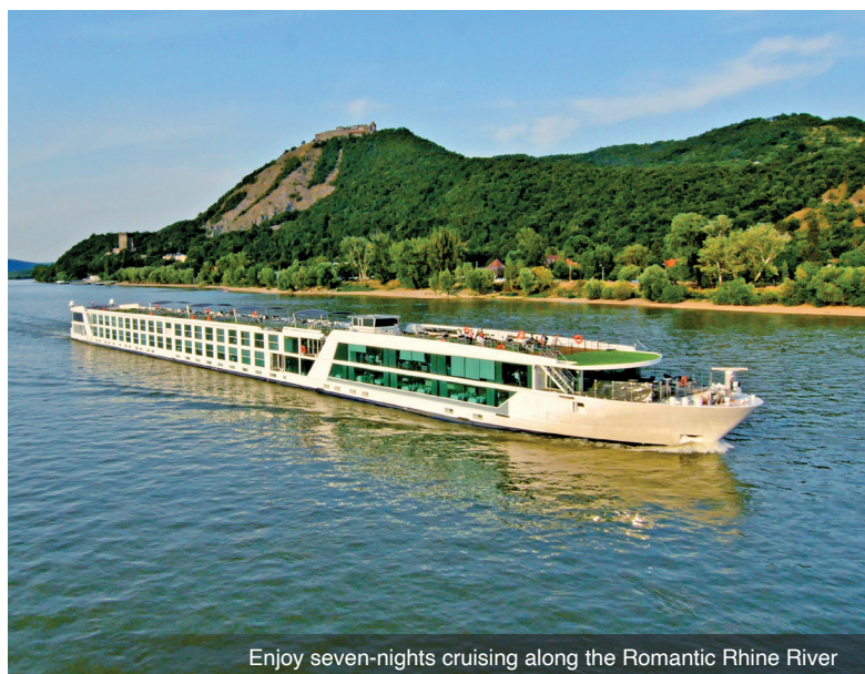
Enjoy seven-nights cruising along the Romantic Rhine River

DAY 1 Depart the USA: Depart the USA on your overnight flight to Amsterdam, the Netherlands.