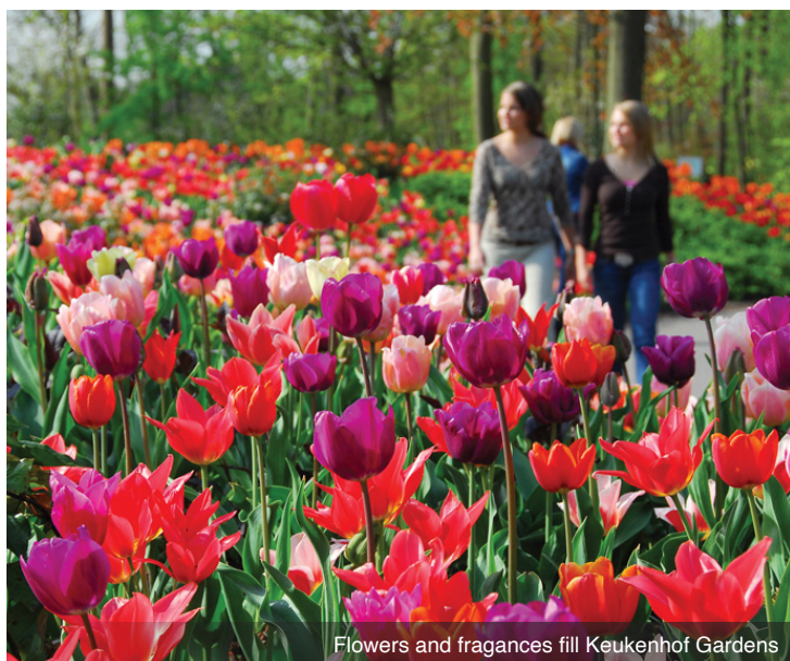
Flowers and fragrances fill Keukenhof Gardens