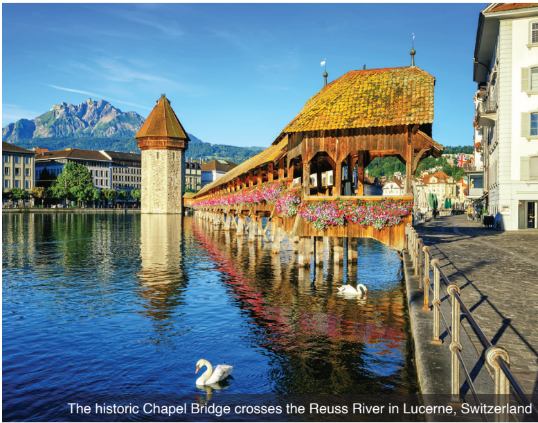
The historic Chapel Bridge crosses the Reuss River in Lucerne, Switzerland

the main cathedral. Alternatively, join a guided bike tour in Breisach. Meals: B, L, D