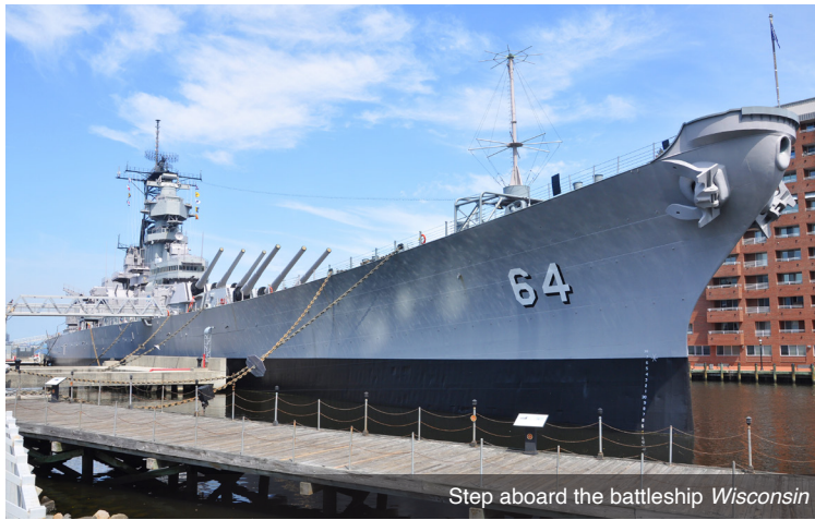
Step aboard the battleship Wisconsin

Numerous food trucks will be available for you to have lunch. Then, explore the history and significance of Fort Monroe, a National Historic Landmark, whose history spans 400 years. Later, visit the Virginia Air and Space Center whose permanent collection spans 100 years of flight, featured over 30 historic aircraft and the Apollo 12 Command Module. Meals: B, D