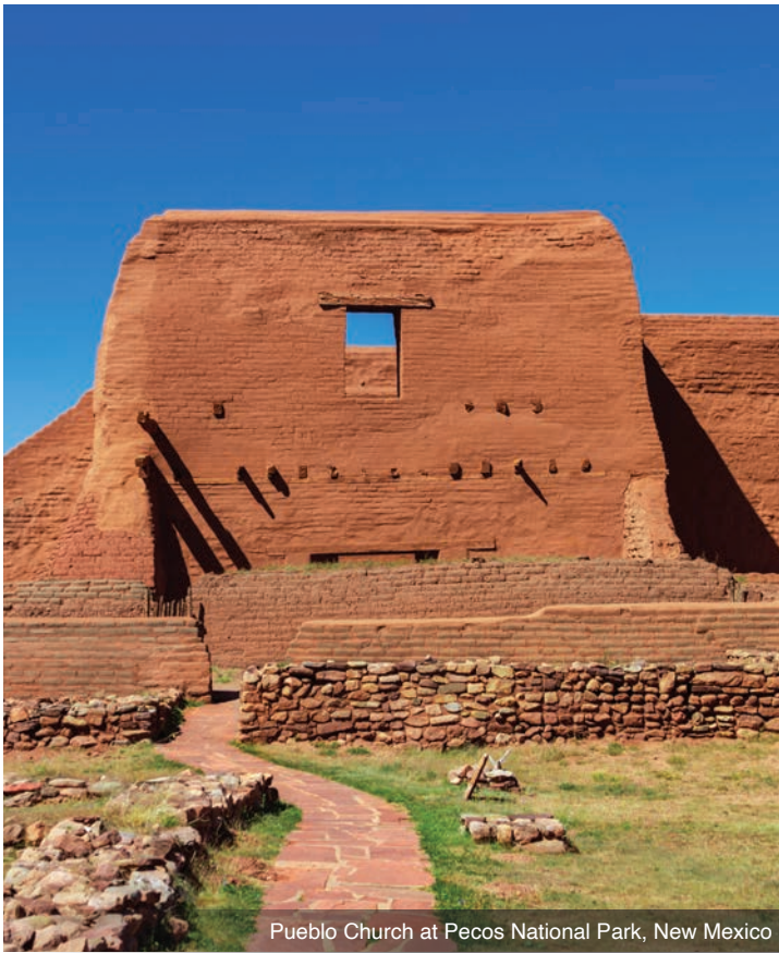
Pueblo Church at Pecos National Park, New Mexico

DAY 5 Pecos National Historic Park: Travel east of Santa Fe to visit Pecos National Historic Park, which features the ruins of Pecos Pueblo and Mission. Pecos encompasses thousands of acres of landscape infused with historical elements from prehistoric archaeological ruins to 19th-century ranches. Tonight, enjoy dinner hosted by your Tour Manager. Meals: B, D