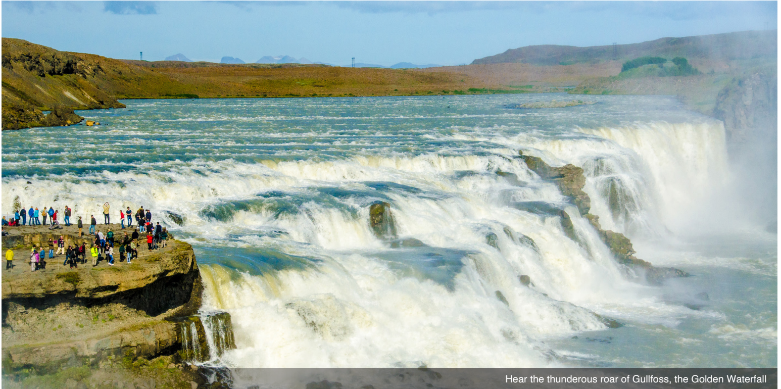
Hear the thunderous roar of Gullfoss, the Golden Waterfall