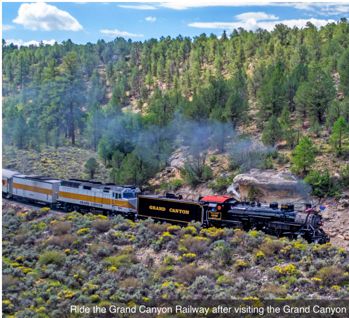
Ride the Grand Canyon Railway after visiting the Grand Canyon

DAY 5 Verde Canyon Railroad: This morning, stop in Jerome, an old mining town and melting pot for those who dreamed of making a quick fortune. Once virtually a ghost town, it is now restored with shops, museums and art. Later, climb aboard the Verde Canyon Railroad for a spectacular journey over old-fashioned trestles, past ancient Indian ruins and through a 700-foot tunnel. Enjoy the views from the comfort of your First Class seat or from one of the open-air viewing cars. Watch for wildflowers, blooming cacti and wildlife in their natural habitat. Tonight, chow down with a chuckwagon supper at the “Blazin’ M Ranch” and Western Stage Show. Meals: B, D