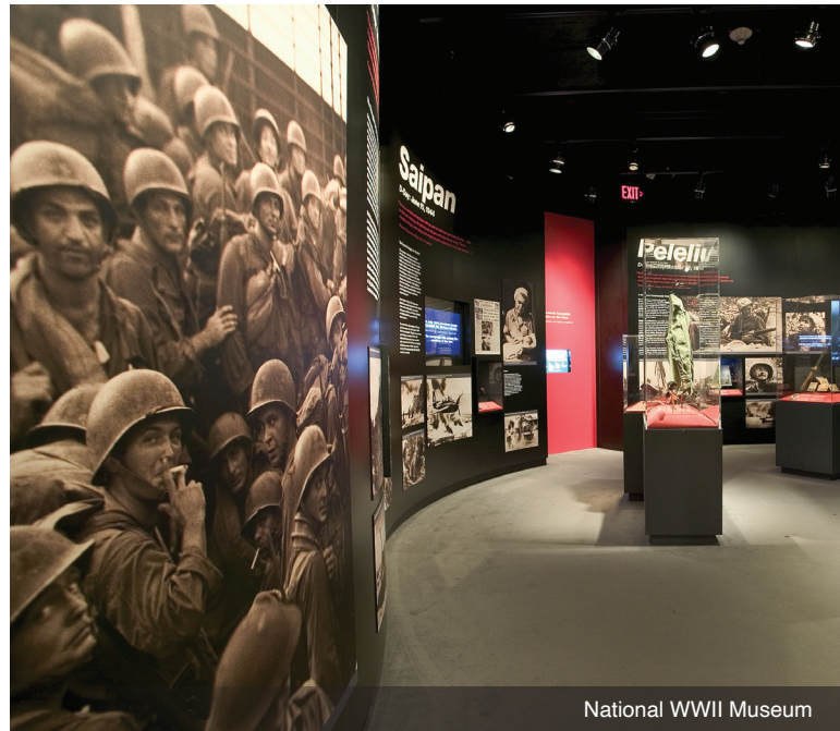
National WWII Museum

DAY 1 Arrive in New Orleans: Welcome to New Orleans, Louisiana, America's jazz capital. Meet your Tour Manager in the hotel Lobby at 6:00 p.m. for a transfer to our welcome dinner and cooking demonstration at the New Orleans School of Cooking. Located in a renovated molasses warehouse in the heart of the French Quarter, you will learn the basics of Louisiana cooking from well-known local chefs. Creole/ Cajun experts teach New Orleans specialties such as Gumbo, Jambalaya and Pralines, and season them with history, trivia and tall tales. You'll be treated to a wide range of local classics and get to enjoy them in sumptuous feast. It's a "ga-ron-tee'd" good time for all. After dinner, feel free to enjoy the French Quarter on your own. Meal: D