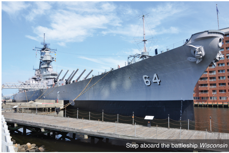
Step aboard the battleship Wisconsin

Numerous food trucks will be available for you to have lunch. Then, explore the history and significance of Fort Monroe, a National Historic Landmark, whose history spans 400 years. Later, visit the Virginia Air and Space Center whose permanent collection spans 100 years of flight, featured over 30 historic aircraft and the Apollo 12 Command Module. Meals: B, D