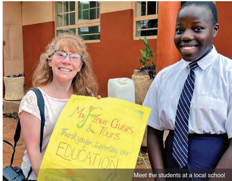
Meet the students at a local school

DAY 1 Depart USA: Depart the USA on your flight to the Republic of Uganda in Africa.