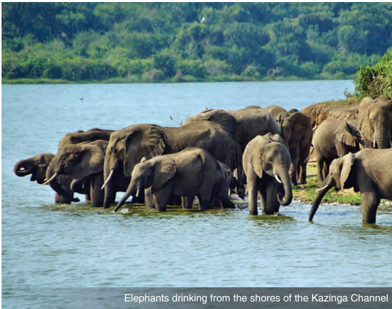
Elephants drinking from the shores of the Kazinga Channel

hyenas before they retreat into the woods to seek shelter from the sun. This afternoon, a different adventure is in store as you set sail on the Kazinga Channel, exploring the waterway known for its various bird species and hippo population. Elephants are often seen drinking from the shores, water buffalo bask in the mud, warthogs run along the shore and plenty of birds inhabit the trees. Spend the evening relaxing at the lodge or enjoy an early-evening game drive through the park. Meals: B, L, D