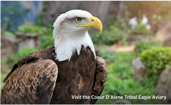
Visit the Coeur D'Alene Tribal Eagle Aviary