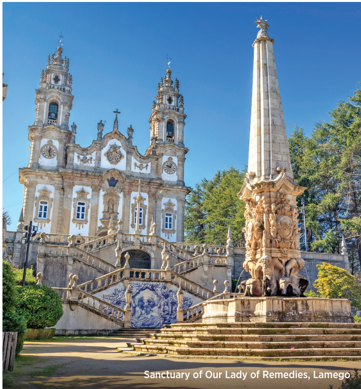
Sanctuary of Our Lady of Remedies, Lamego

Return to the ship for lunch and relax on deck as the ship sails through idyllic surroundings on the way to Régua. Meals: B, L, D