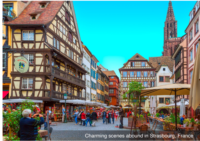
Charming scenes abound in Strasbourg, France

DAY 1 Depart the USA: Today you'll depart the USA on your overnight flight to Zurich, Switzerland.