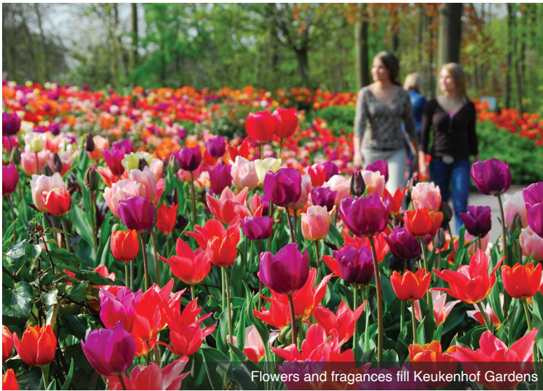
Flowers and fragrances fill Keukenhof Gardens

DAY 9 Düsseldorf – Cologne: Join a walking tour of Düsseldorf, a vibrant city renowned for its stylish boutiques and charming Old Town. Stroll along the picturesque Rhine River, admire the stunning architecture, and discover hidden gems off the beaten path. Later this day we will arrive in Cologne, famous for its Gothic Cathedral. This afternoon you can immerse yourself in the city's lively atmosphere, indulge in delicious local cuisine, and experience the unique charm of the city. Meals: B, L, D