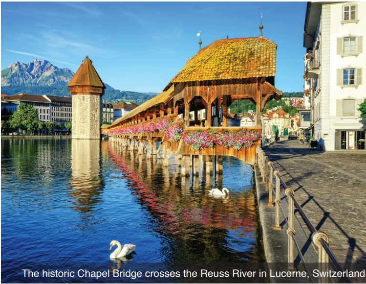
The historic Chapel Bridge crosses the Reuss River in Lucerne, Switzerland