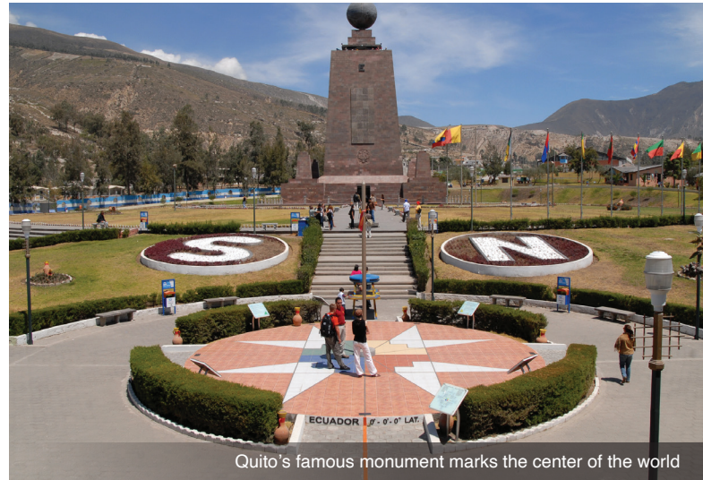
Quito's famous monument marks the center of the world

DAY 1 Depart the USA: Depart the USA on a flight to Quito, Ecuador. Upon arrival, you'll be met by a representative of Mayflower Cruises and Tours and assisted with the transfer to the hotel. Enjoy the remainder of the evening to experience this amazing city on your own.