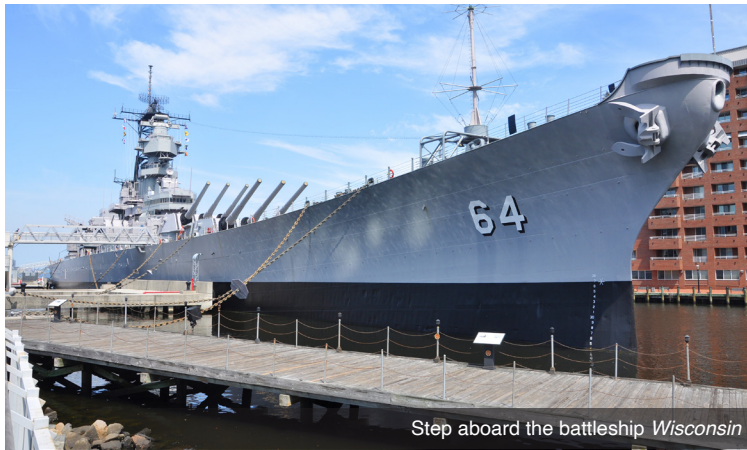
Step aboard the battleship Wisconsin

Later, climb aboard the Hampton Queen for a narrated cruise of Hampton Harbor. With over 20 points of interest and over 400 years of history from the founding of Jamestown in 1607 to current Norfolk Naval Base, the cruise is filled with history. Some highlights of the tour include Virginia Air & Space Science Center, Fort Monroe, Old Point Comfort Lighthouse and possibly even some dolphin sightings. Meals: B, D