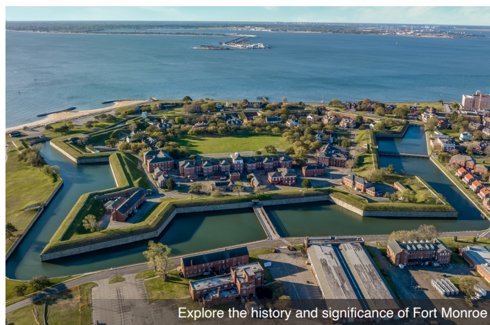
Explore the history and significance of Fort Monroe

Witness the sailing of a fleet of the world's most magnificent international tall ships and military ships in an epic peacetime gathering. Norfolk is a selected gathering port for more than 55 ships from 20 nations. Numerous food trucks will be available for you to have lunch. Then, explore the history and significance of Fort Monroe, a National Historic Landmark, whose history spans 400 years.