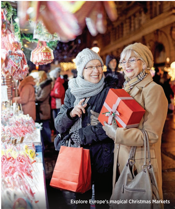
Explore Europe's magical Christmas Markets