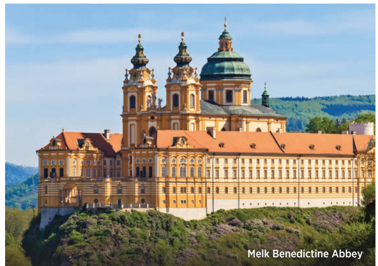
Melk Benedictine Abbey