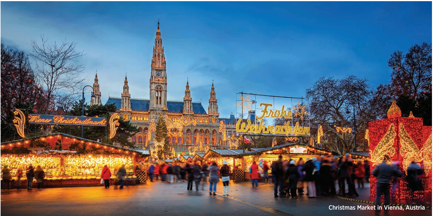
Christmas Market in Vienna, Austria