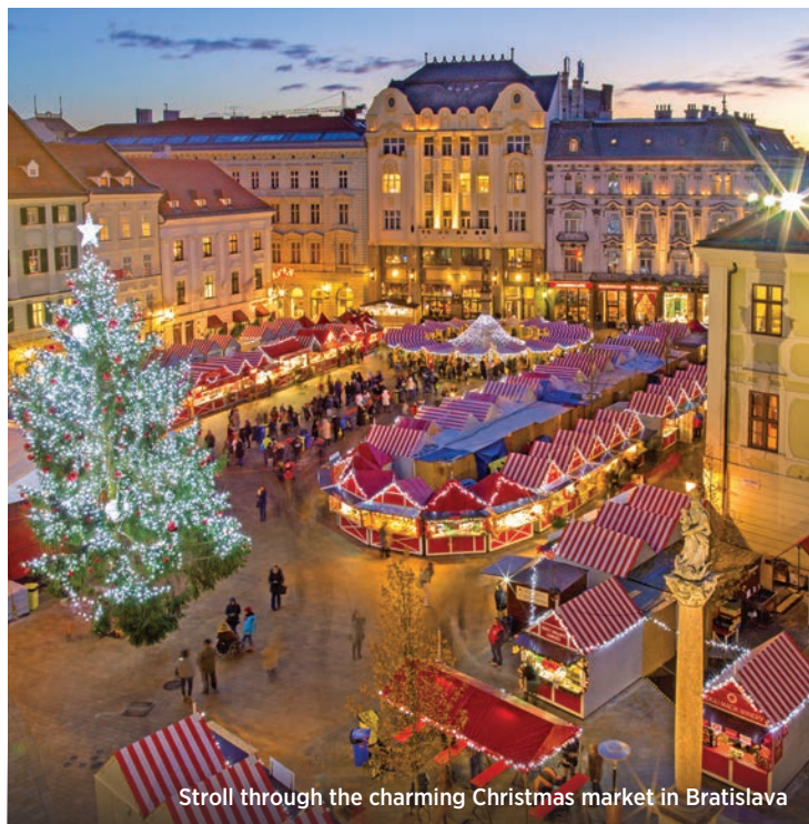
Stroll through the charming Christmas market in Bratislava

This important historic trading centre, known as the 'City of Three Rivers' – where three of Europe's main waterways converge – borders Austria and showcases a distinctive blend of cultures. Its beautiful historic centre features charming Baroque buildings, stunning riverside views and narrow cobblestone streets, all infused with the aroma of freshly baked gingerbread. In front of the green-domed façade of St. Stephen's Cathedral, Passau's annual Christkindlmarkt can be found. Here, you can sample some delicious warm Glühwein and freshly baked goods. Back on board your Emerald Star-Ship tonight, enjoy live local entertainment showcasing typical Bavarian musical traditions. Meals: B, L, D