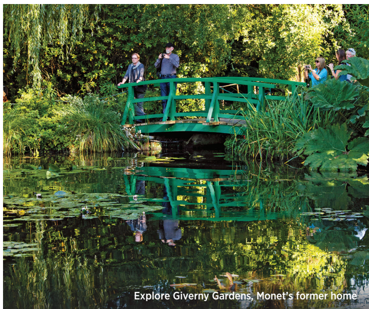
Explore Giverny Gardens, Monet's former home

landed, as well as the memorials and museum, which honor the bravery of those involved and their ultimate sacrifice. Your Star-Ship remains docked in Honfleur overnight. Meals: B, L, D