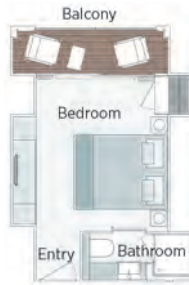
Grand Balcony Suite