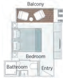
Panorama Balcony Suite