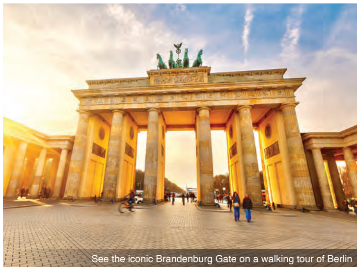
See the iconic Brandenburg Gate on a walking tour of Berlin