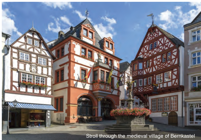
Stroll through the medieval village of Bernkastel

DAY 1 Depart the USA: Depart the USA on your overnight flight to Berlin, Germany.