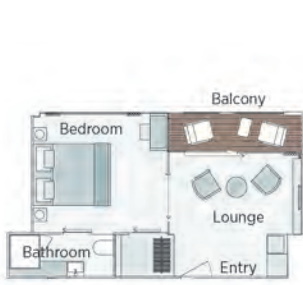
Owner's One-Bedroom Suite