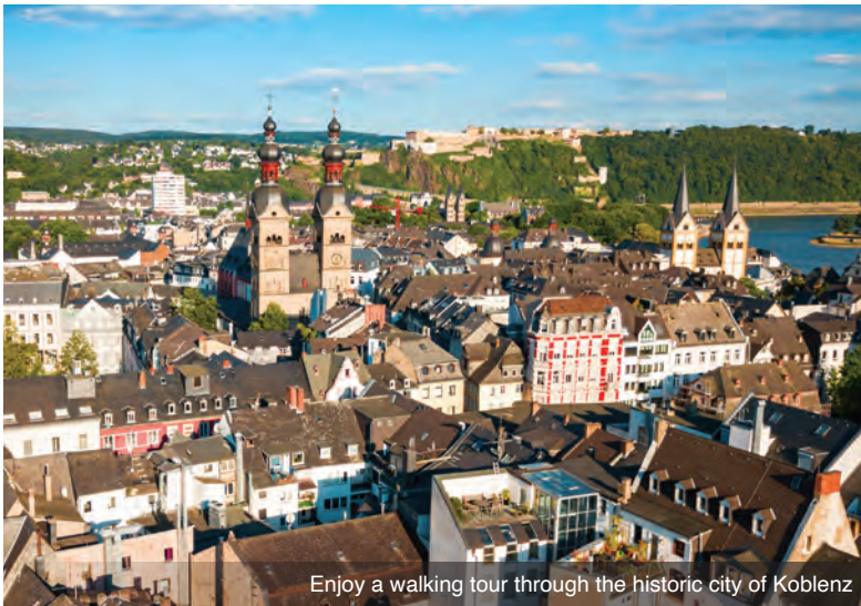
Enjoy a walking tour through the historic city of Koblenz

invitation for every history and culture enthusiast to appreciate one of the highest hill castles along the Moselle River. Meals: B, L, D