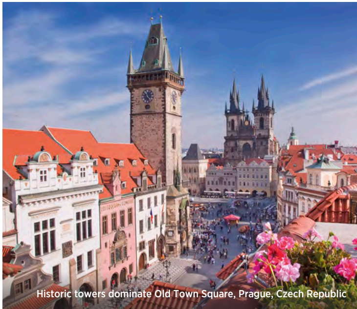
Historic towers dominate Old Town Square, Prague, Czech Republic