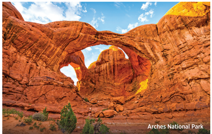
Arches National Park