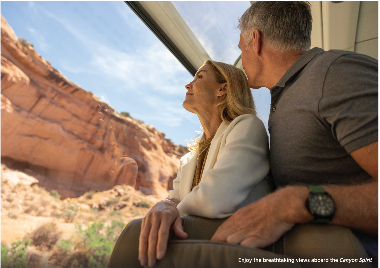
Enjoy the breathtaking views aboard the Canyon Spirit