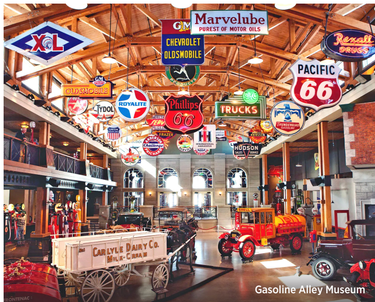
Gasoline Alley Museum

Get to know Calgary on a panoramic sightseeing tour of the city. Get your first glimpse of the Canadian Rockies from high atop the 626-foot tall Calgary Tower. Then, take a step back into Canada's colorful past at Heritage Park. Here you will learn about life as a 19th-century fur-trader or old-fashioned blacksmith.