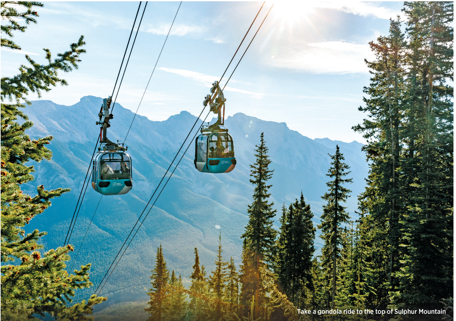
Take a gondola ride to the top of Sulphur Mountain