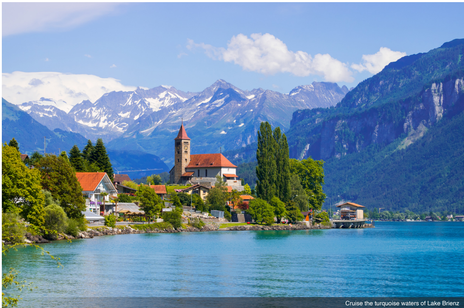
Cruise the turquoise waters of Lake Brienz