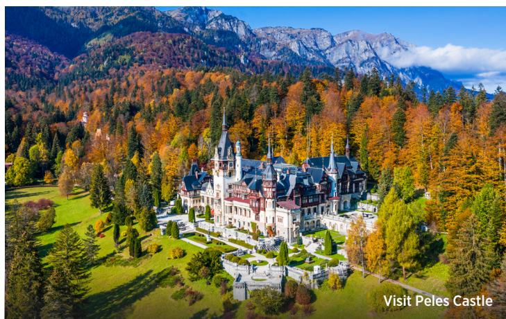
Visit Peles Castle

A walking tour includes the St Nicholas Church and a visit of the First Romanian School Museum, leading centers of the Romanian community. The museum houses the oldest Romanian bible, printed on goats' skin. Stroll through Brasov's historical medieval center, learning of its German heritage, and visit Black Church, the largest Gothic church east of Vienna. Meal: B