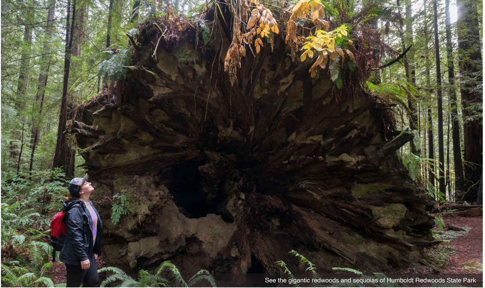
See the gigantic redwoods and sequoias of Humboldt Redwoods State Park