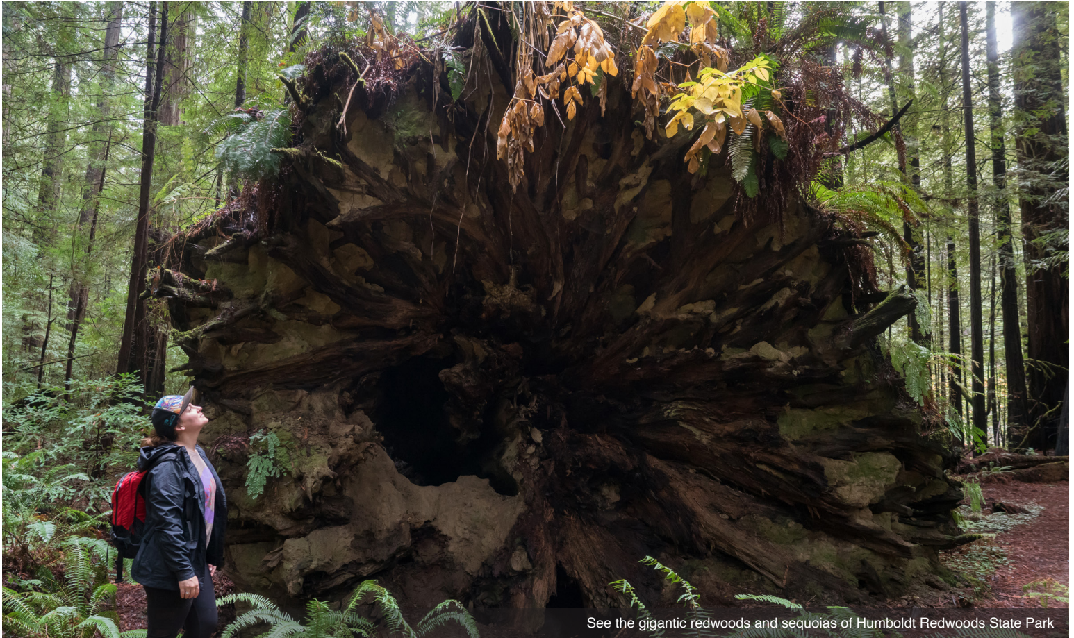
See the gigantic redwoods and sequoias of Humboldt Redwoods State Park