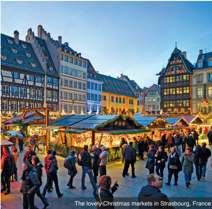
The lovely Christmas markets in Strasbourg, France