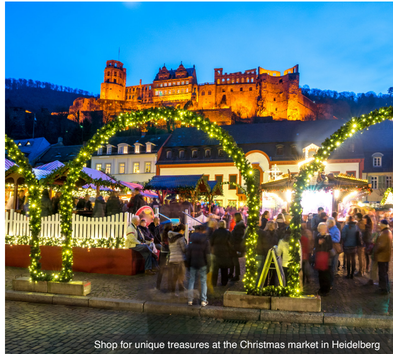
Shop for unique treasures at the Christmas market in Heidelberg

DAY 1 Depart the USA: Depart the USA on your overnight flight to Zurich, Switzerland.