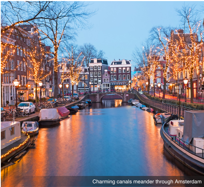
Charming canals meander through Amsterdam

than 100 glittering, festive, cottage-style stands filled with Lebkuchenherzen (traditional gingerbread hearts) and other special treats and handicrafts, all creating a magical European Christmas experience. Meals: B, L, D