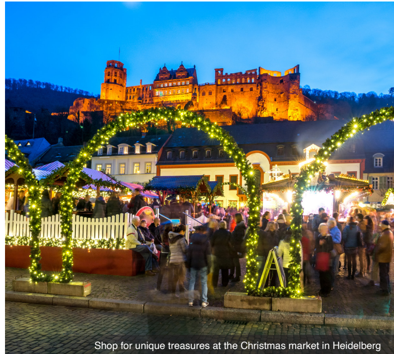
Shop for unique treasures at the Christmas market in Heidelberg

DAY 1 Depart the USA: Depart the USA on your overnight flight to Zurich, Switzerland.