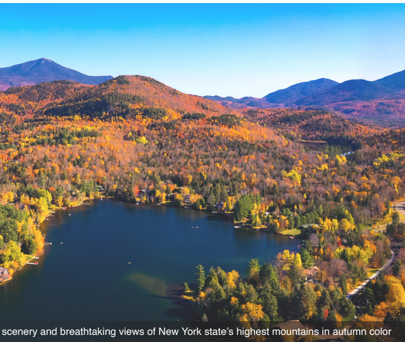
scenery and breathtaking views of New York state's highest mountains in autumn color