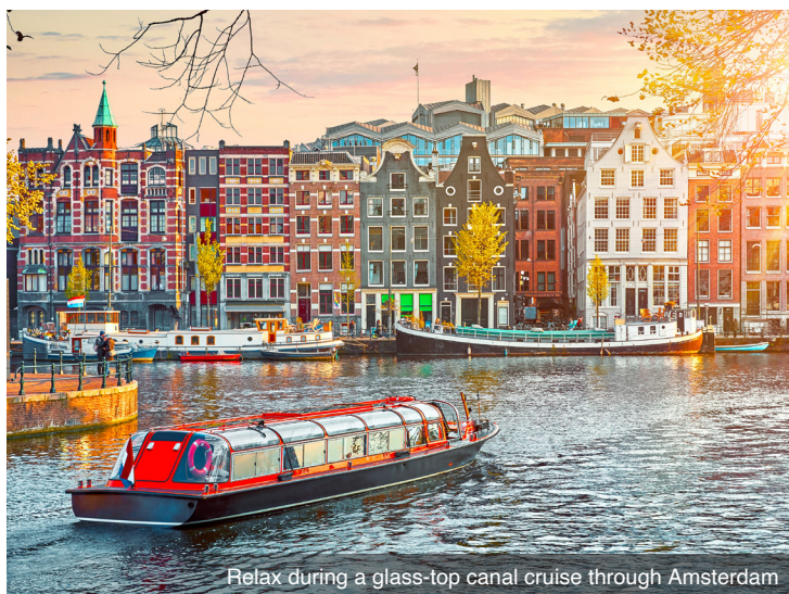
Relax during a glass-top canal cruise through Amsterdam