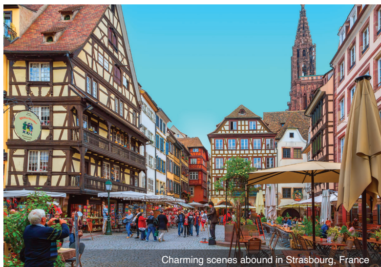
Charming scenes abound in Strasbourg, France

DAY 1 Depart the USA: Depart the USA on your overnight flight to Amsterdam, the Netherlands.