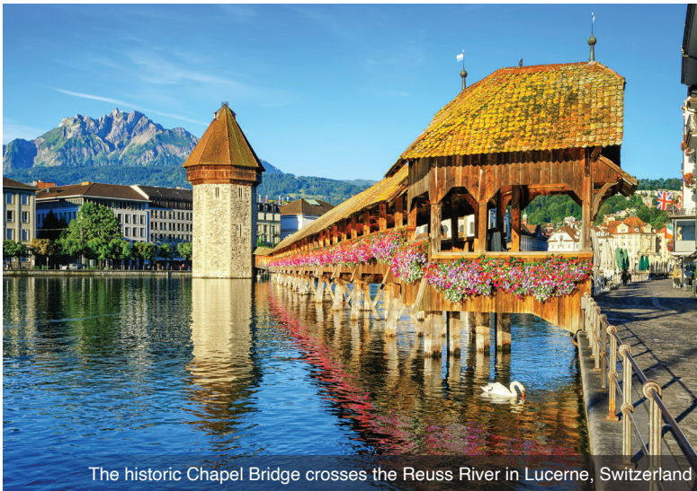
The historic Chapel Bridge crosses the Reuss River in Lucerne, Switzerland

DAY 8 Breisach, Germany / Freiburg: On today's adventure, visit the city of Freiburg, considered the 'capital of the Black Forest'. Aside from seeing the lovely sights, sample true Black Forest delicacies from the lively market in the city center near the main cathedral. Alternatively, join a guided bike tour in Breisach. Meals: B, L, D