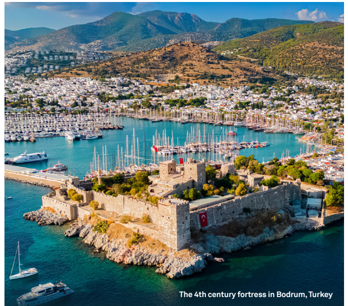
The 4th century fortress in Bodrum, Turkey

The itinerary is a guide only and may be amended for operational reasons. As such Mayflower & Scenic cannot guarantee the tour will operate unaltered from the itinerary stated above. Please refer to our terms and conditions for further information.