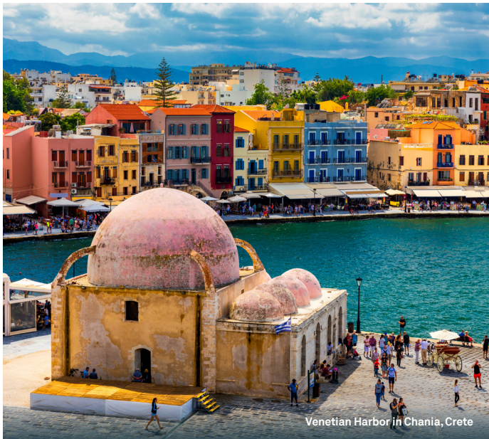
Venetian Harbor in Chania, Crete