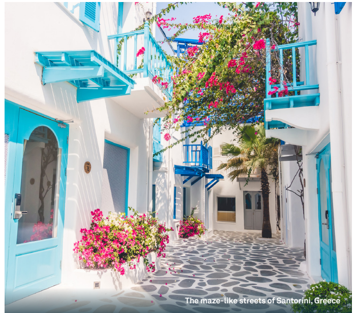
The maze-like streets of Santorini, Greece

its edge for the breathtaking sunset that paints the sky hues of orange and pink. Return to the ship for dinner with newly made friends or ask your butler for a private meal delivered to your suite before retreating to your supremely comfortable Scenic Slumber Bed. Meals: B. L. D.