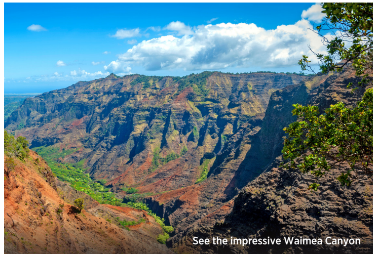
See the impressive Waimea Canyon