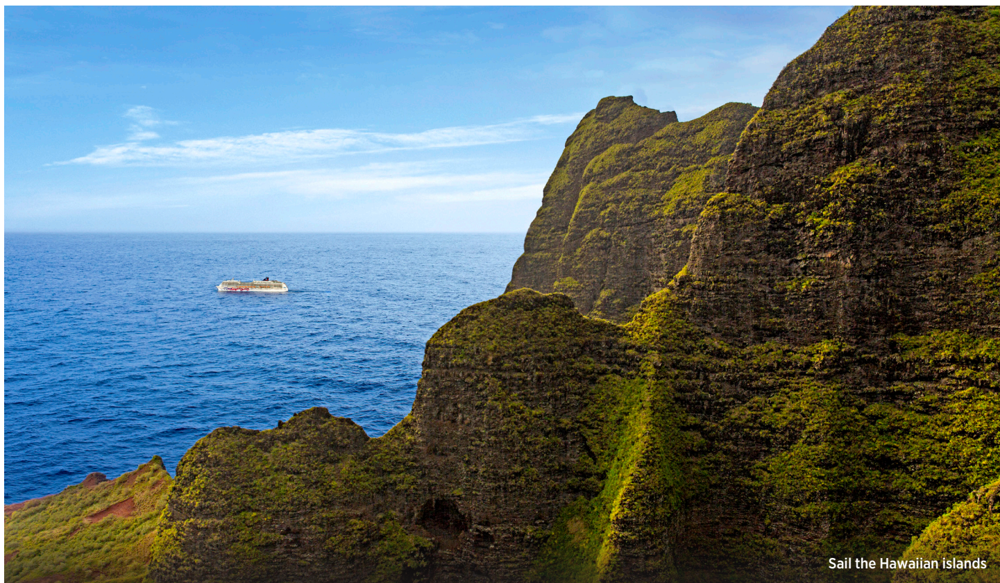
Sail the Hawaiian islands