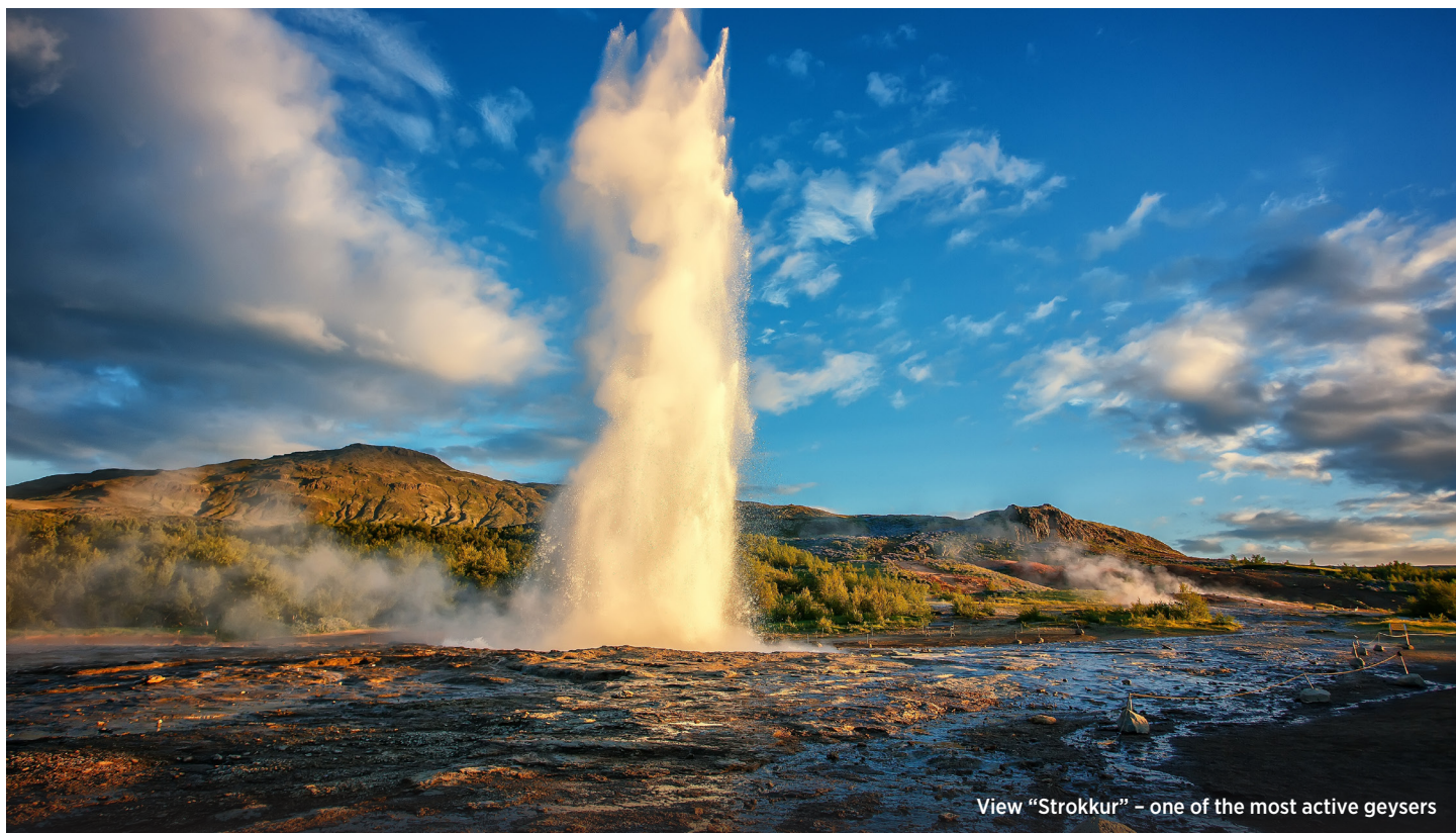
View “Strokkur” – one of the most active geysers