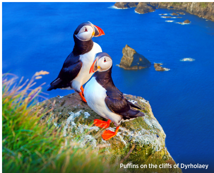
Puffins on the cliffs of Dyrholaey

Iceland is full of surprises – for one, it isn't covered in ice! It's a stunning mix of green plains, wild volcanic scenery, beautiful coasts and lakes, spouting geysers, hot springs, mud pools and sophisticated cities. Topped off by clean, fresh air, you'll find yourself in a trance surrounded by unique natural beauty throughout the country. Upon arrival, you'll be met by a representative of Mayflower Cruises & Tours and transferred to your hotel in the town of Hveragerdi or Selfoss. Rooms will be available for check-in upon arrival. All flights should arrive by 3:30 pm. This evening, enjoy a welcome dinner at the hotel. Meal: D