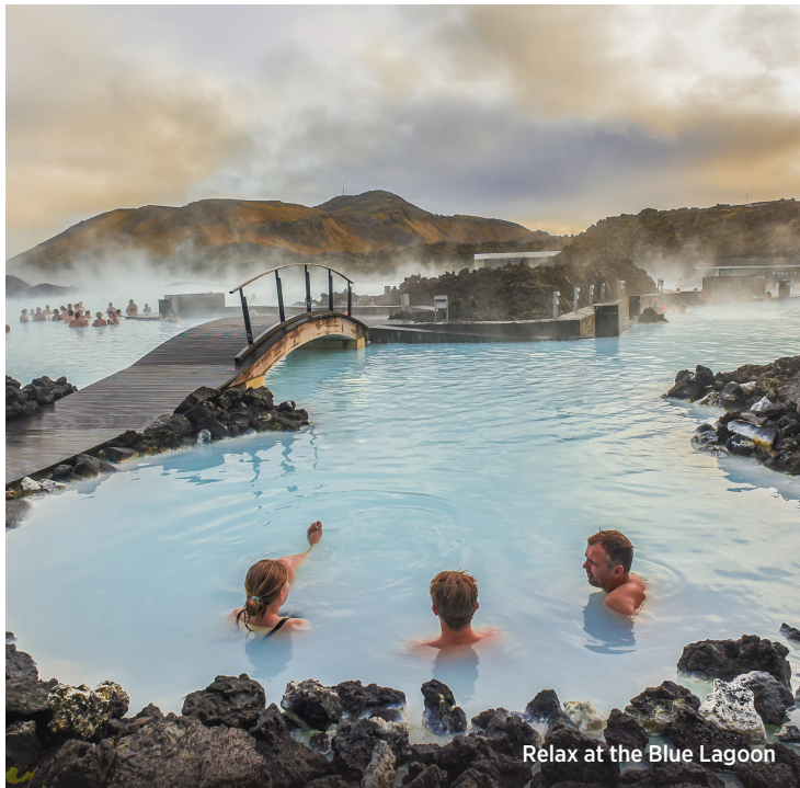
Relax at the Blue Lagoon