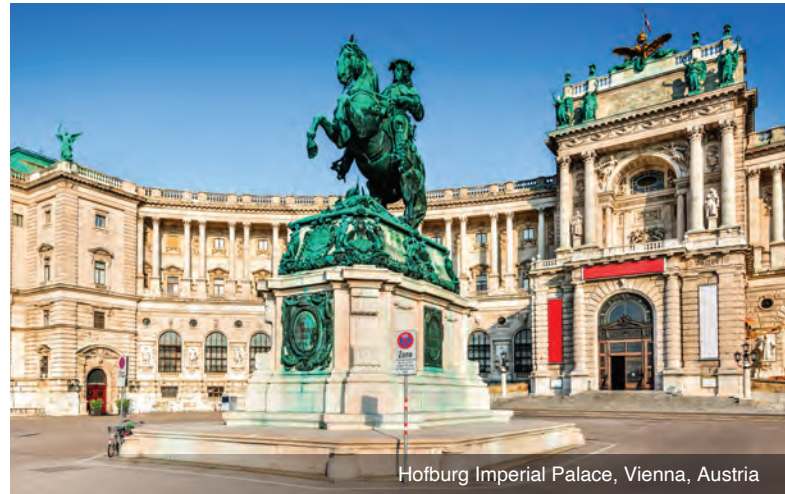
Hofburg Imperial Palace, Vienna, Austria

DAY 1 Depart the USA: Depart the USA on your overnight flight to Budapest, Hungary.