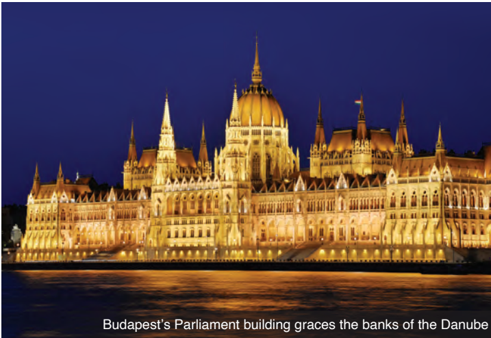
Budapest's Parliament building graces the banks of the Danube