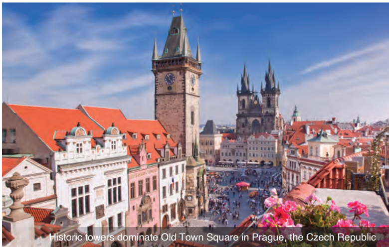
Historic towers dominate Old Town Square in Prague, the Czech Republic

the UNESCO World Heritage city center and see many of the city's architectural highlights. Enjoy a Bavarian sausage tasting during the tour for a real 'taste' of local life! Alternatively, join a bike tour to the Walhalla Monument, towering high above the slopes of the Danube. The site affords a fascinating view of the surrounding landscape and the river below. This evening, a traditional Bavarian band performs onboard. The ship remains docked in Regensburg overnight.