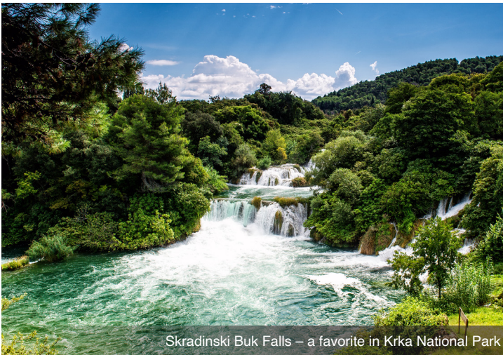
Skradinski Buk Falls – a favorite in Krka National Park