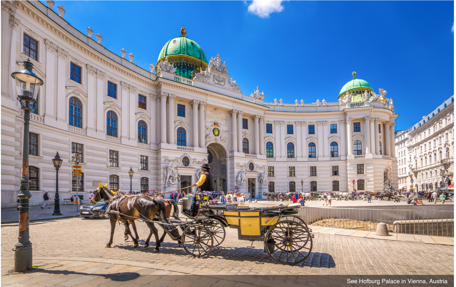
See Hofburg Palace in Vienna, Austria