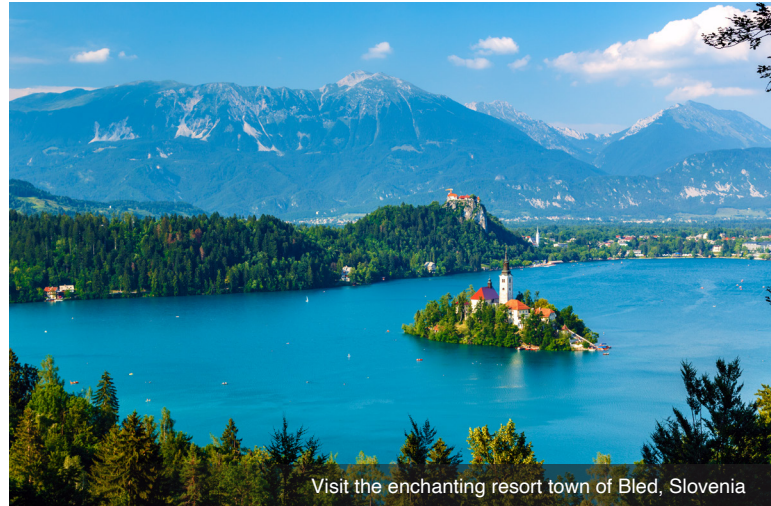
Visit the enchanting resort town of Bled, Slovenia

DAY 1 Depart the USA: Depart the USA on your overnight flight to Dubrovnik, Croatia.