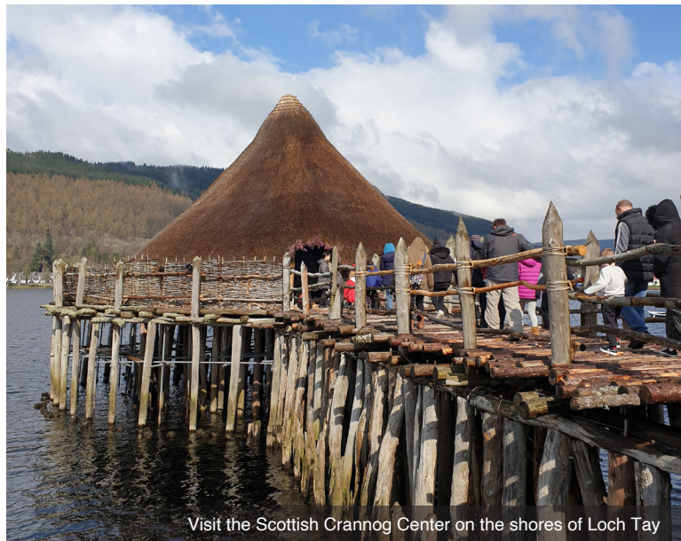
Visit the Scottish Crannog Center on the shores of Loch Tay

DAY 1 Depart the USA: Depart your gateway city on an overnight flight to Glasgow, Scotland.