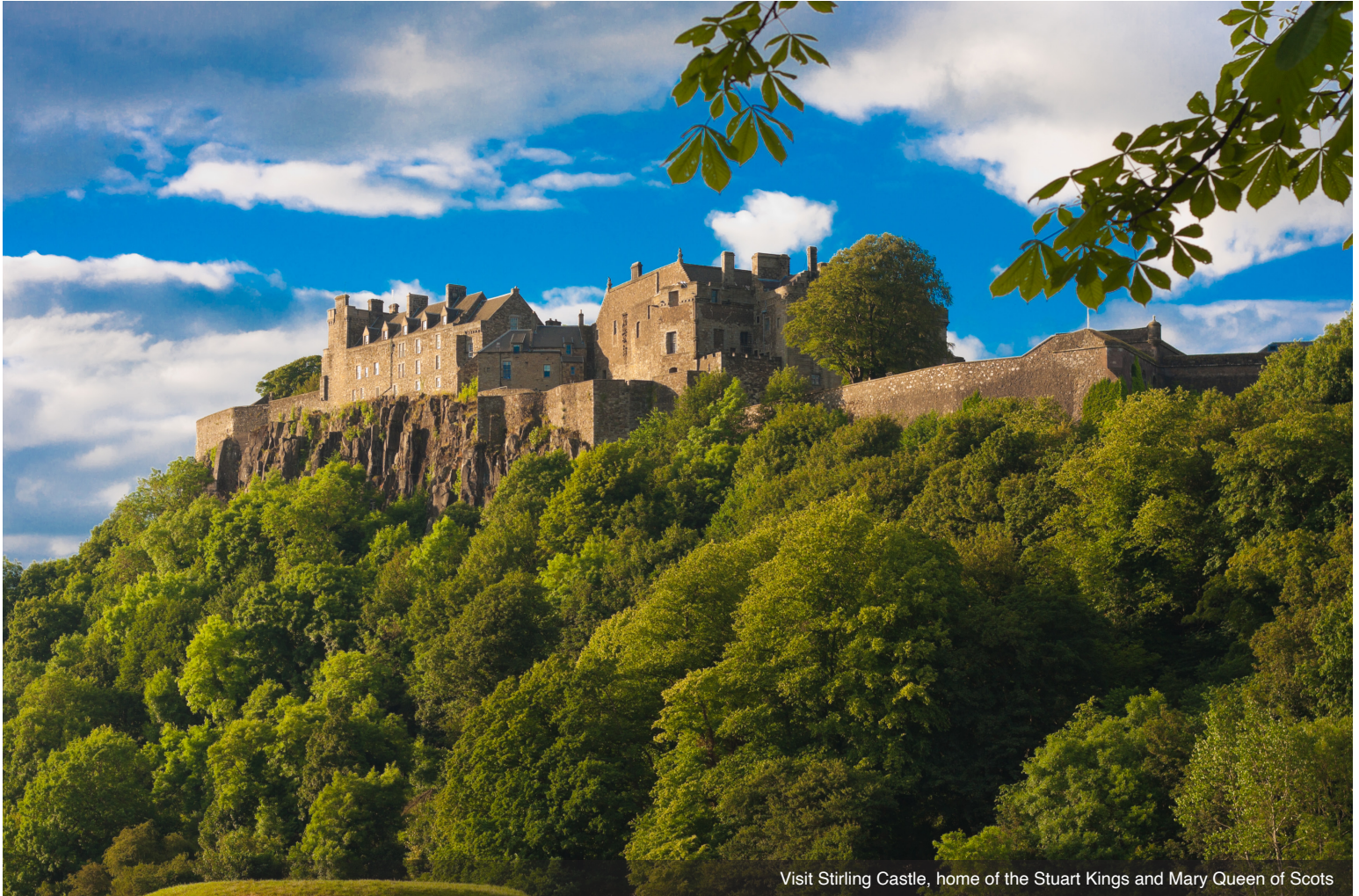
Visit Stirling Castle, home of the Stuart Kings and Mary Queen of Scots