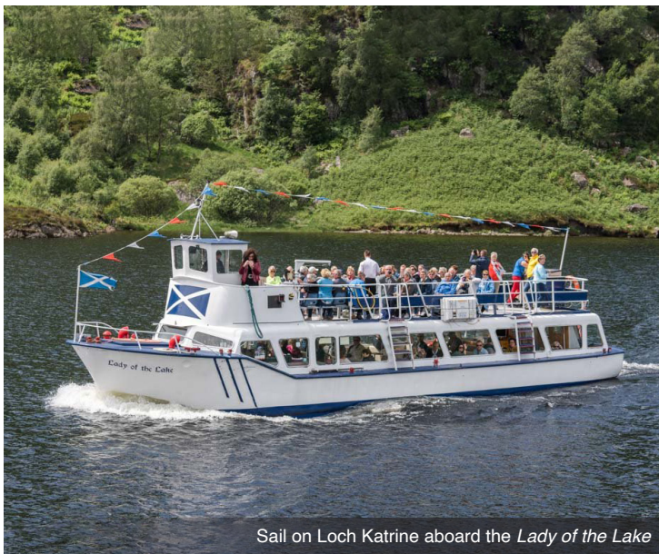
Sail on Loch Katrine aboard the Lady of the Lake