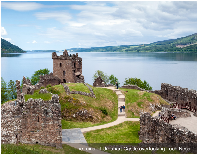
The ruins of Urquhart Castle overlooking Loch Ness

panoramic city tour, see the historic Old Town and the elegant Georgian New Town, both UNESCO World Heritage Sites. Visit the city's icon, Edinburgh Castle, perched high atop a hill, offering panoramic views of stately mountains, rolling hills and lovely countryside. Inside the castle, stand in awe of the Scottish Crown Jewels, featuring the crown, sword, and scepter, which are among the oldest regalia in Europe. After free time for lunch on your own, depart for Roslin, a tiny village outside Edinburgh, where you visit Rosslyn Chapel. This 15th-century church is famous for its decorative art and mysterious associations with the Knights Templar and the Holy Grail. This evening, dinner is included. Meals: B, D