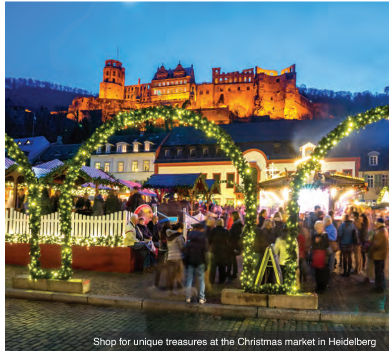
Shop for unique treasures at the Christmas market in Heidelberg

DAY 1 Depart the USA: Depart the USA on your overnight flight to Zurich, Switzerland.