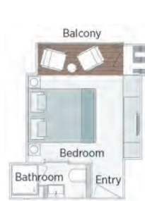
Panorama Balcony Suite