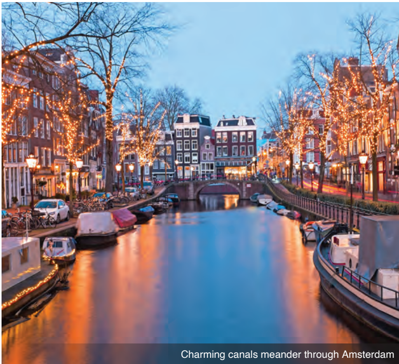
Charming canals meander through Amsterdam

A visit to Ehrenbreitstein Fortress, crossing the river via aerial tram, is also included. After the excursion, time to visit more than 100 glittering, festive, cottage-style stands filled with Lebkuchenherzen (traditional gingerbread hearts) and other special treats and handicrafts, all creating a magical European Christmas experience. Meals: B, L, D