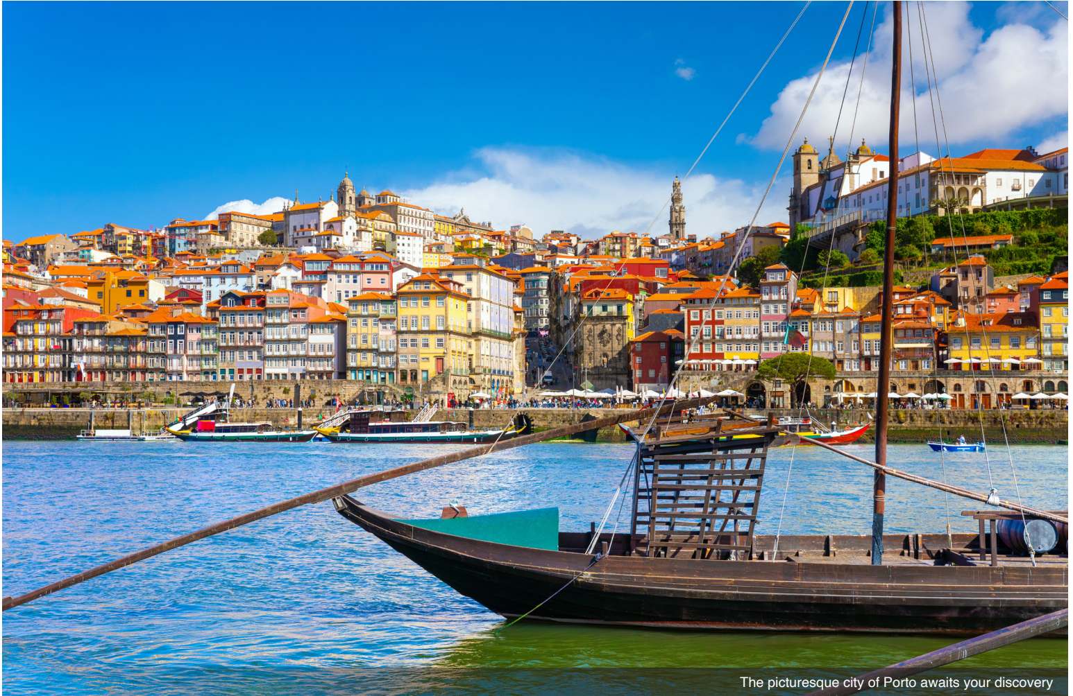
The picturesque city of Porto awaits your discovery