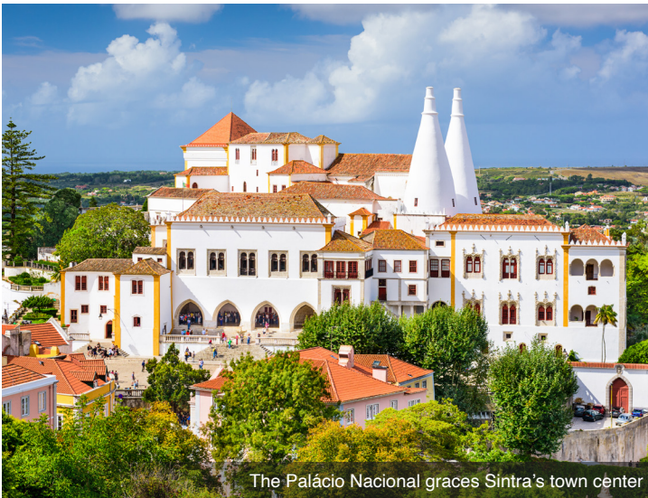
The Palácio Nacional graces Sintra's town center