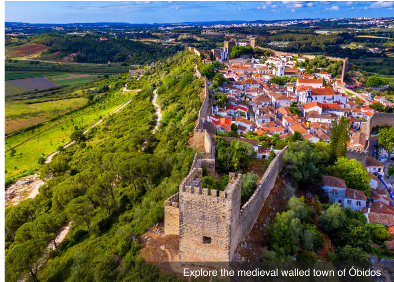
Explore the medieval walled town of Óbidos

DAY 1 Depart the USA: Depart the USA on your overnight flight to Lisbon, Portugal.