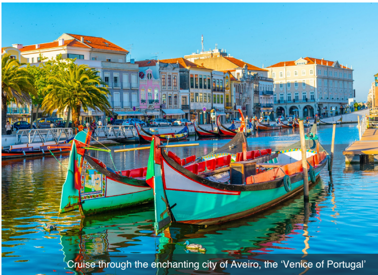
Cruise through the enchanting city of Aveiro, the 'Venice of Portugal'

emotion of the performers as they sing songs telling tales of life, struggle and passion while you dine. Meals: B, D